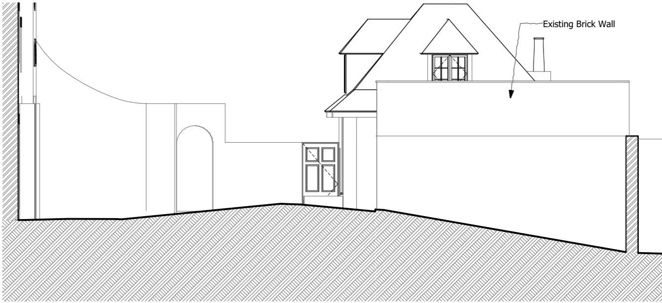
2 West Elevation Existing 1:100