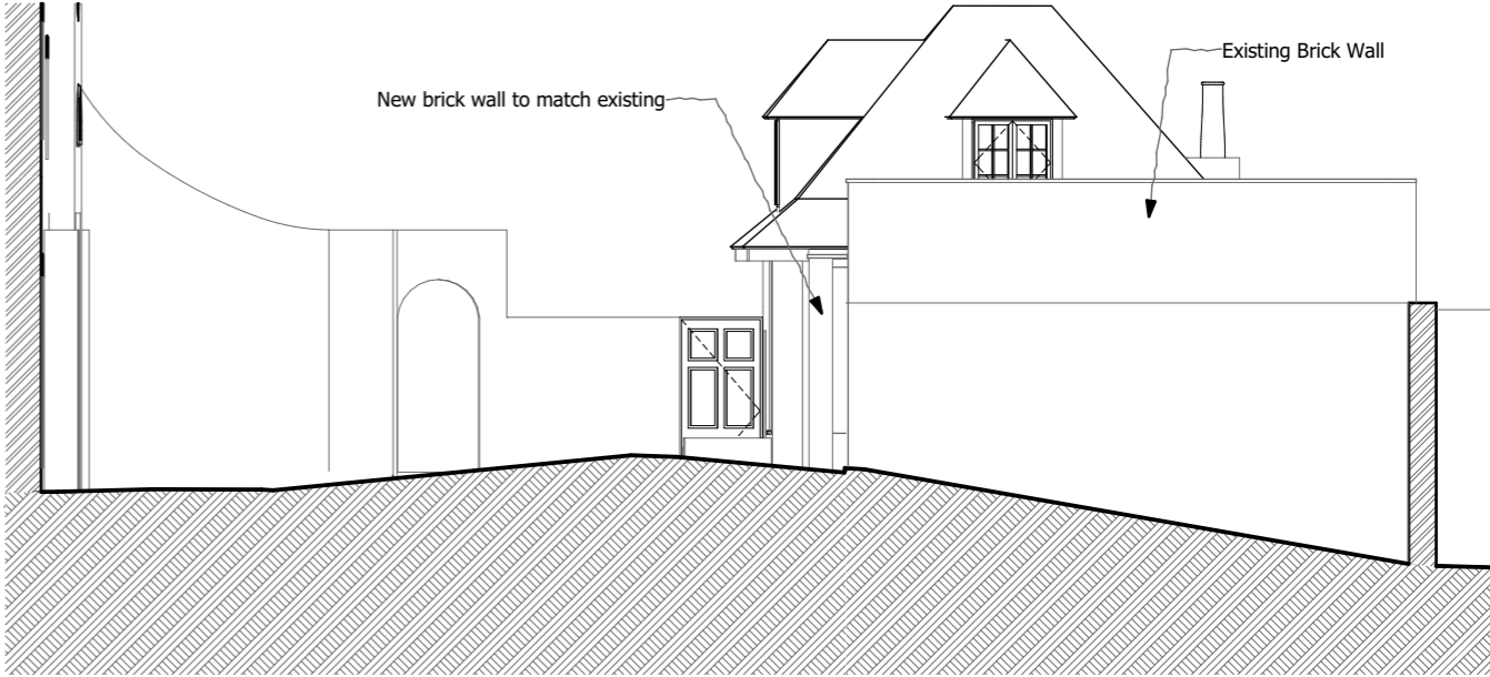
4 West Elevation Proposed 1:100