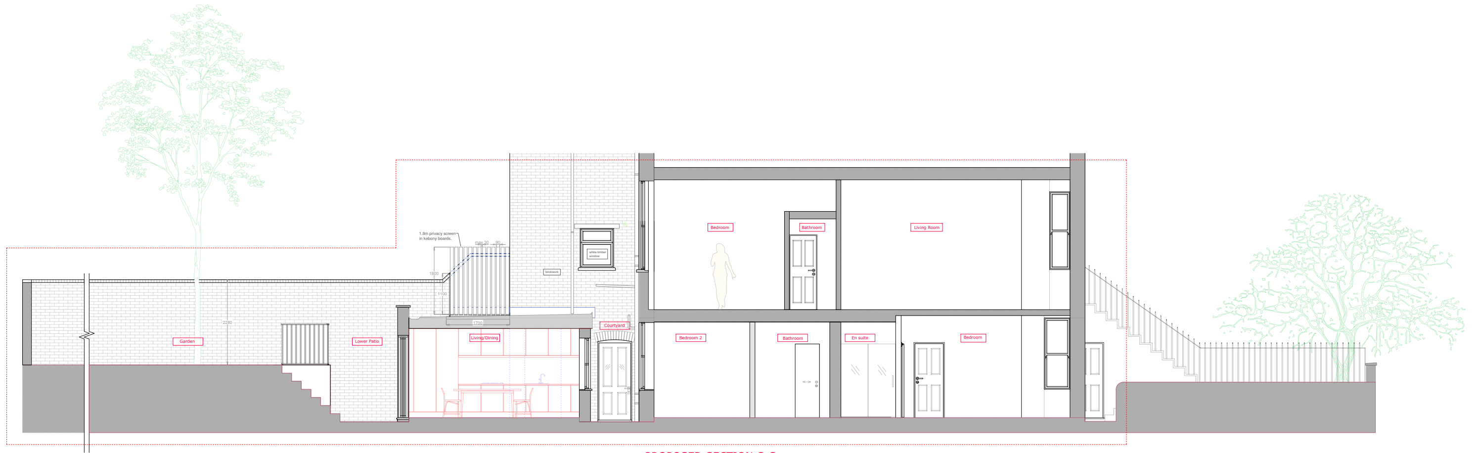
PROPOSED SECTION C-C