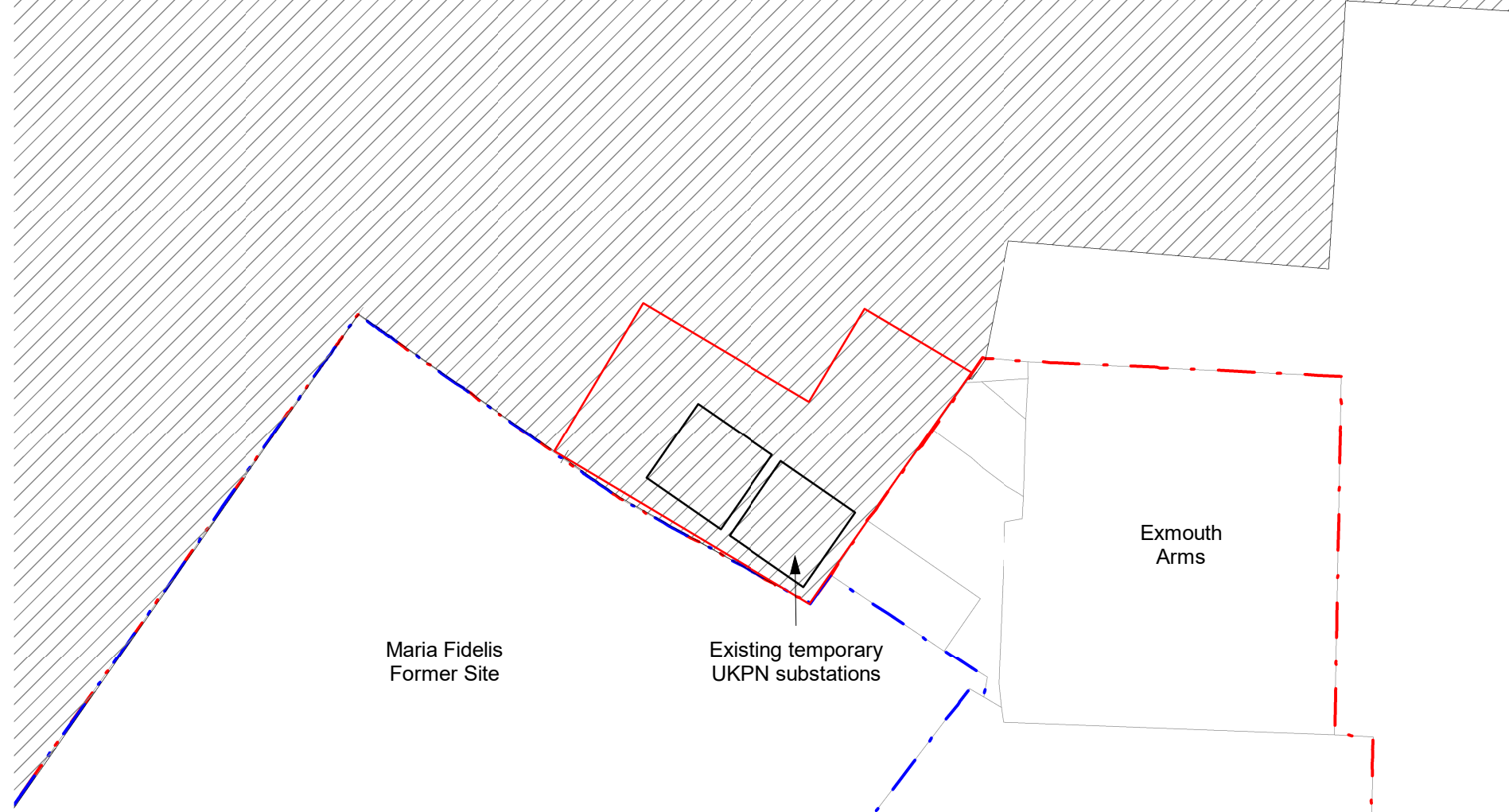
1 GA Plan - Existing UKPN Substations - Ground Level 022321 1 : 200