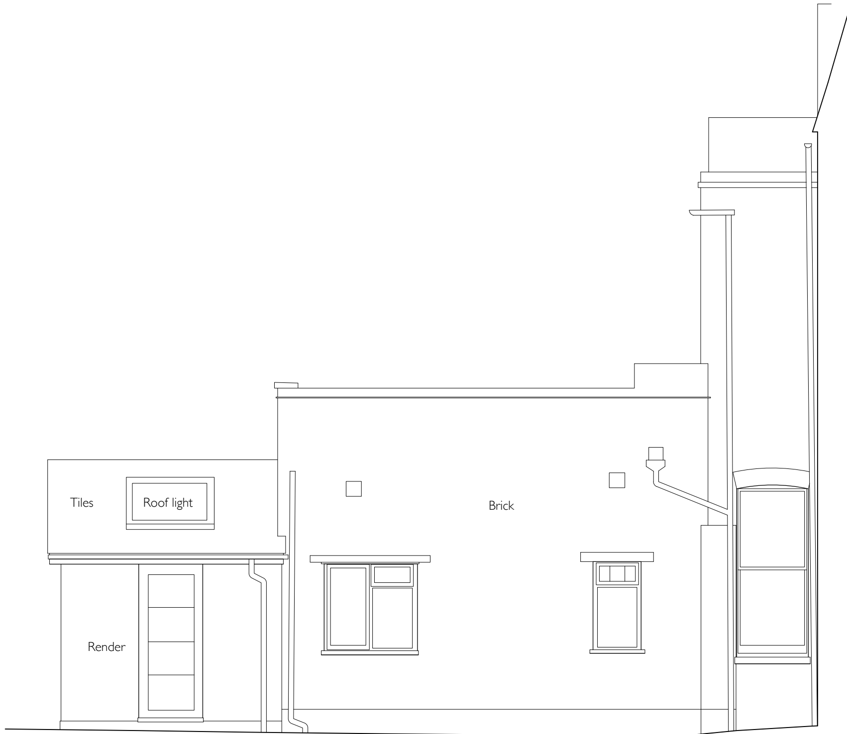
B EXISTING - Return rear Elevation Scale 1-50