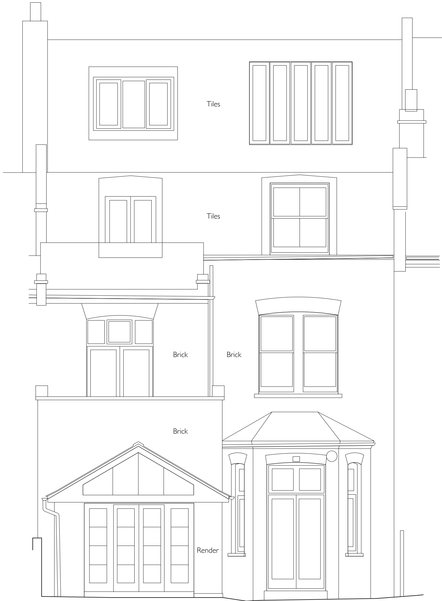
A EXISTING - Rear Elevation Scale 1-50