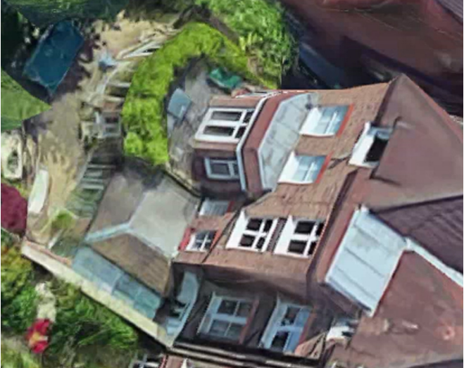
Image showing extent of lower ground and ground floor extensions at 36 Fitzjohns Avenue