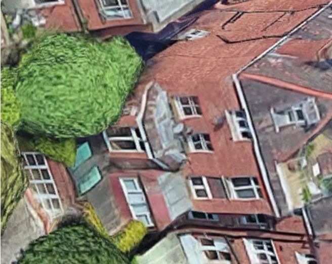
Image showing extent of lower ground and ground floor rear extensions at 32 Fitzjohns Avenue