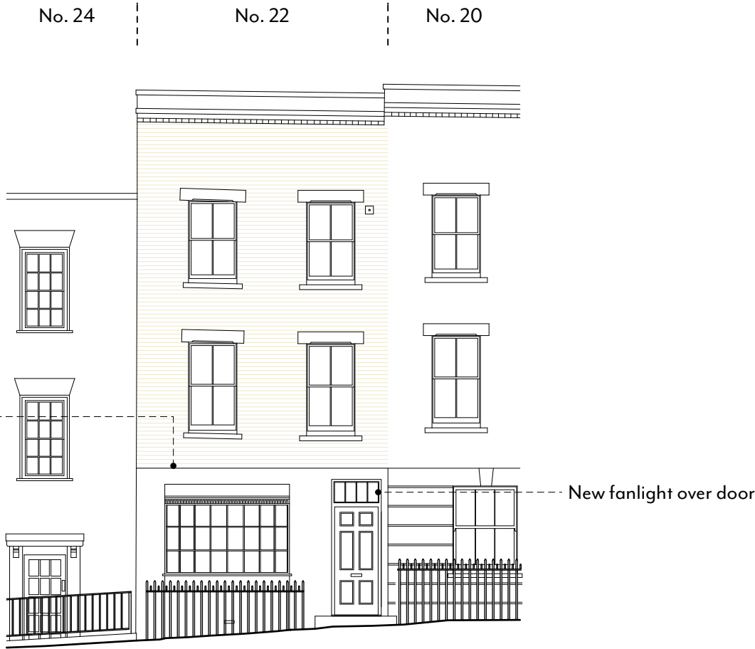
PROPOSED STREET ELEVATION

This drawing is to be read in conjunction with the contract specification, the engineer's drawings and specification, and where appropriate the drawings and specifications prepared by relevant sub contractors.