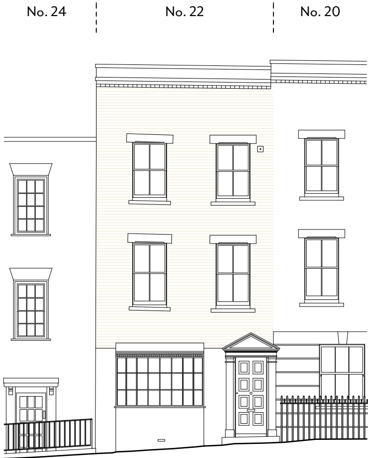
EXISTING STREET ELEVATION