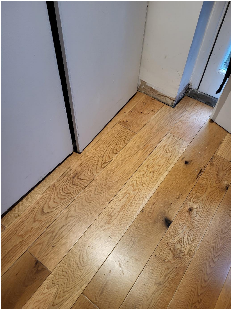
Interior – wardrobe to be demolished