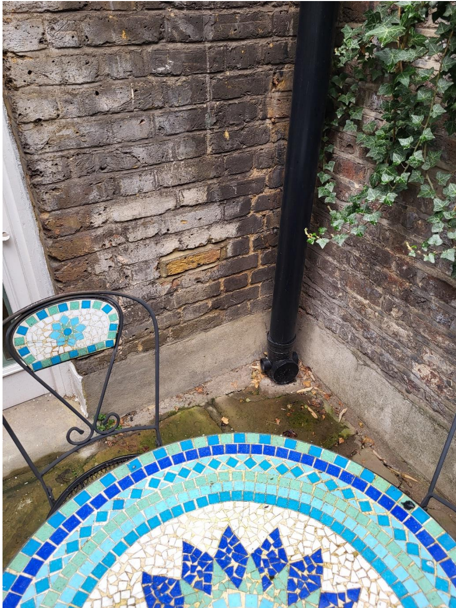
Existing drain that new WC will drain into.