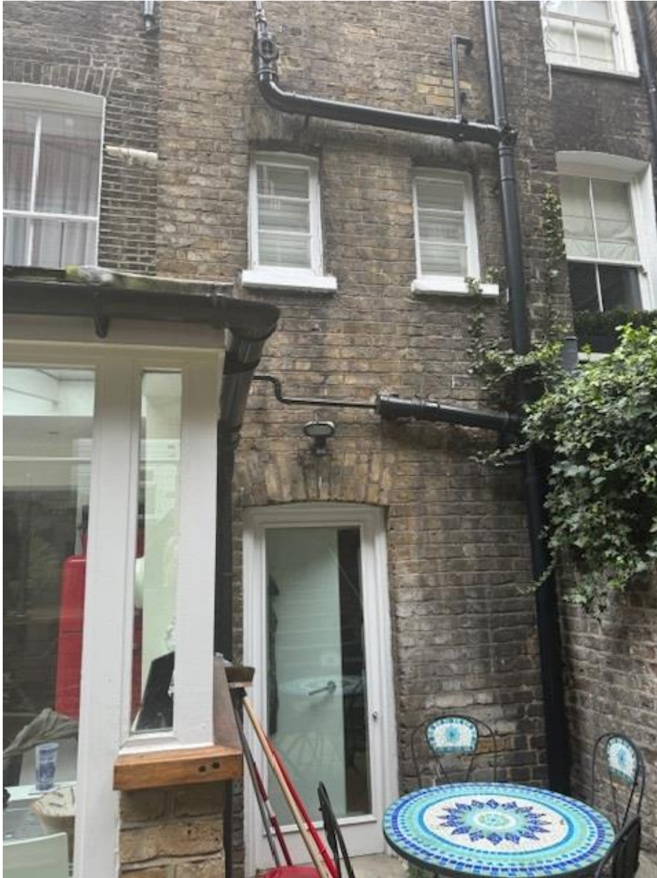
Lower ground floor rear – glazed door to be replaced.