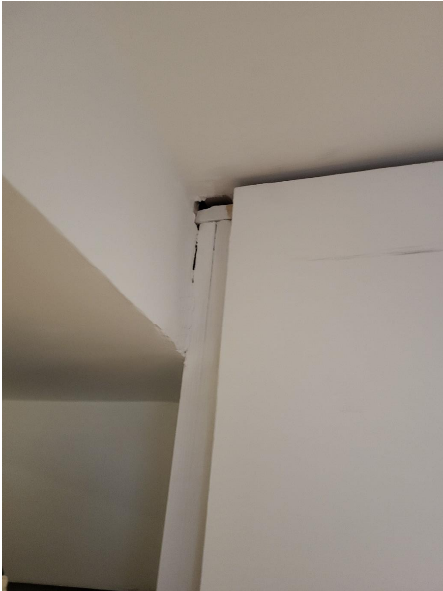
Internal – non-original wardrobe to be demolished.