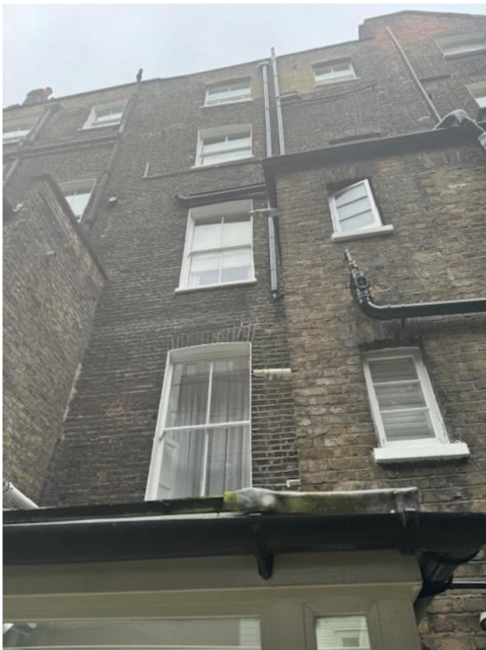
Rear elevation of 6 Handel St, upper ground floor and above.