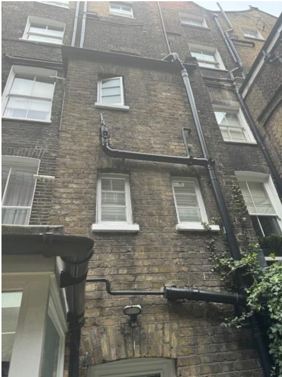
Rear elevation of 6 Handel St, upper ground floor and above.