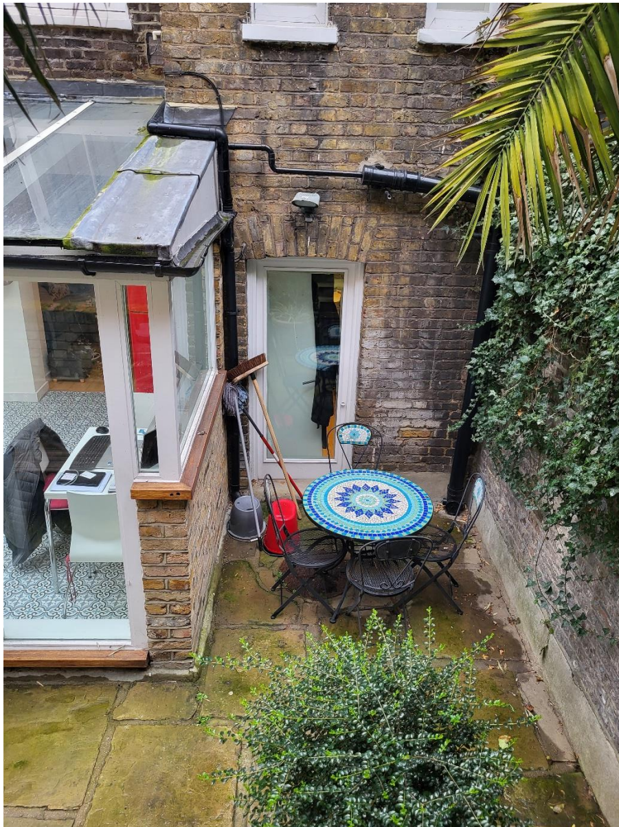
Existing glazed door to be replaced.