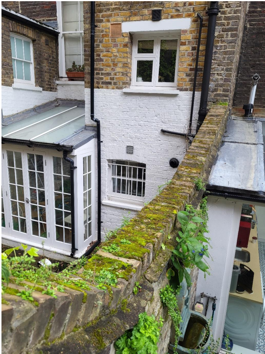
7 Handel St showing original window opening.