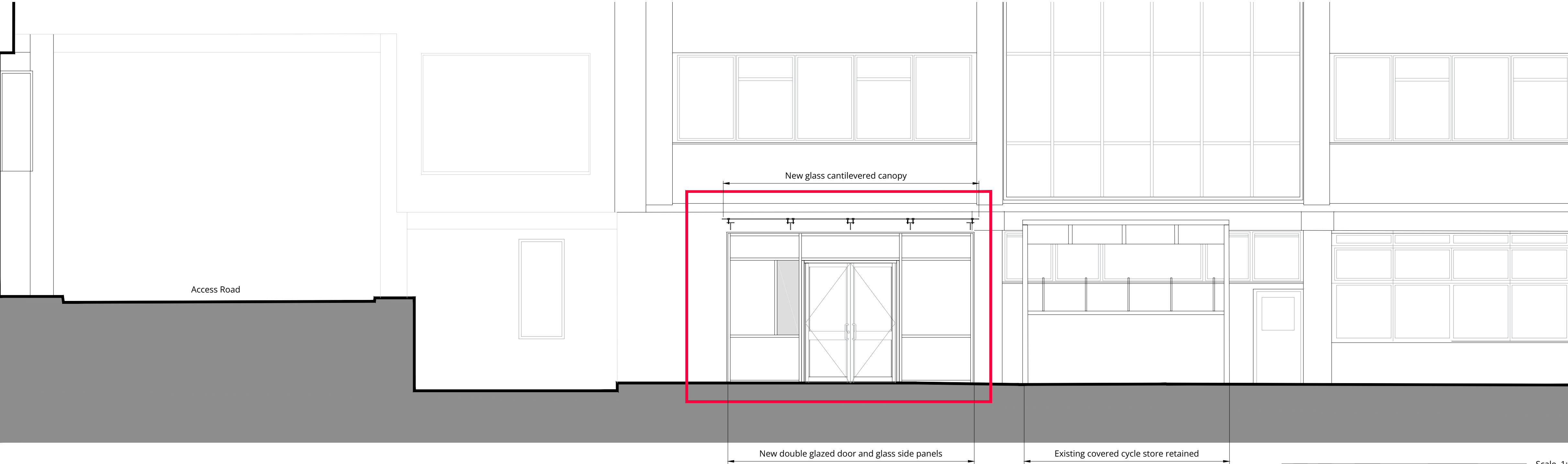
Basement Plan as Existing