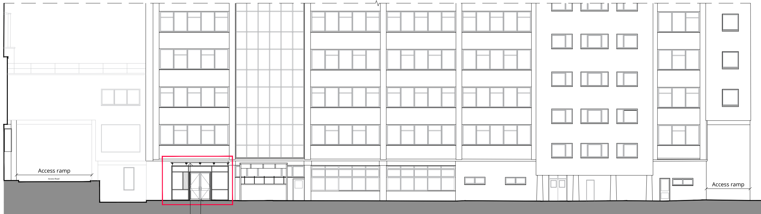
Existing North West Elevation

THIS DRAWING IS TO BE READ IN CONJUNCTION WITH ALL RELEVANT STRUCTURAL ENGINEERS AND MECHANICAL AND ELECTRICAL ENGINEERS DRAWINGS, DETAILS AND SPECIFICATIONS.