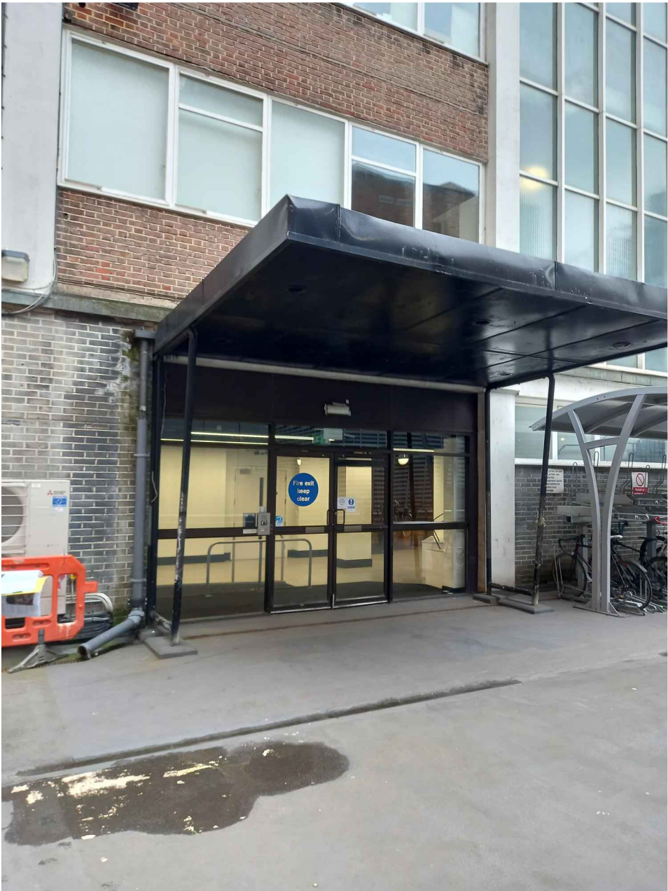
Site Image Existing Canopy and entrance doors/ glazing to be replaced