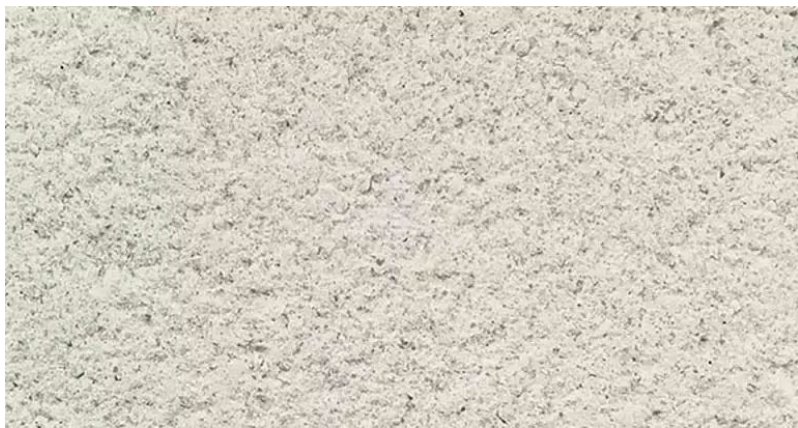
04. CEMENTITIOUS RENDER