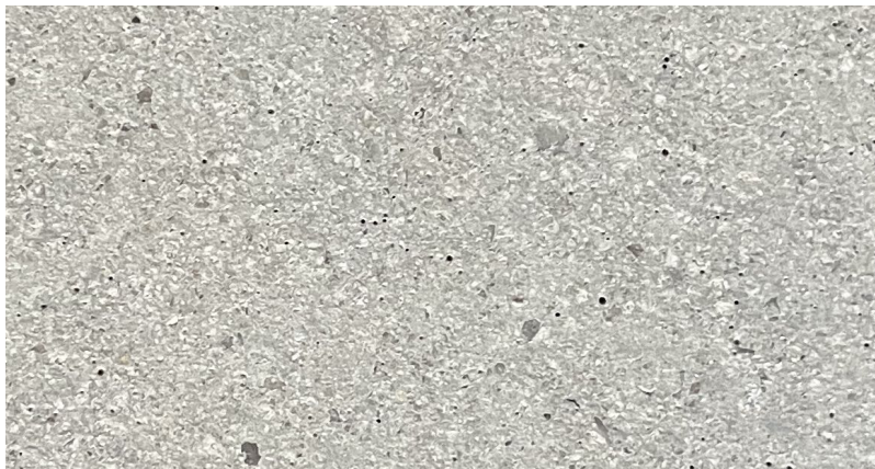
03. PRECAST CONCRETE