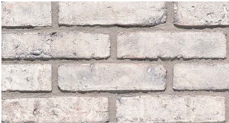
01. FACING BRICKWORK