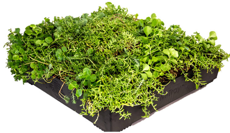
05. GREEN ROOF