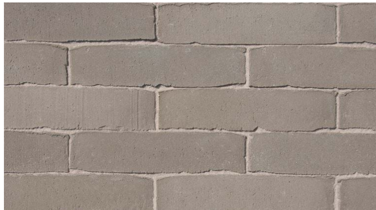
09. BRICK PAVERS