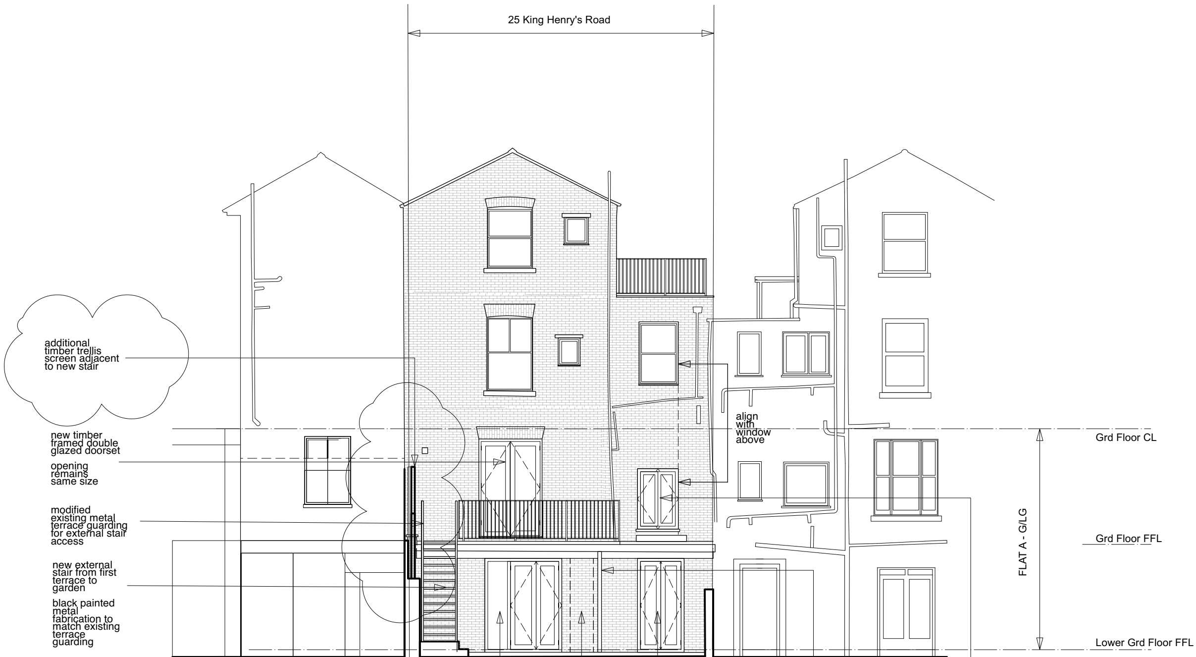
REAR ELEVATION (SOUTH) - Proposed 1.100 @ A3