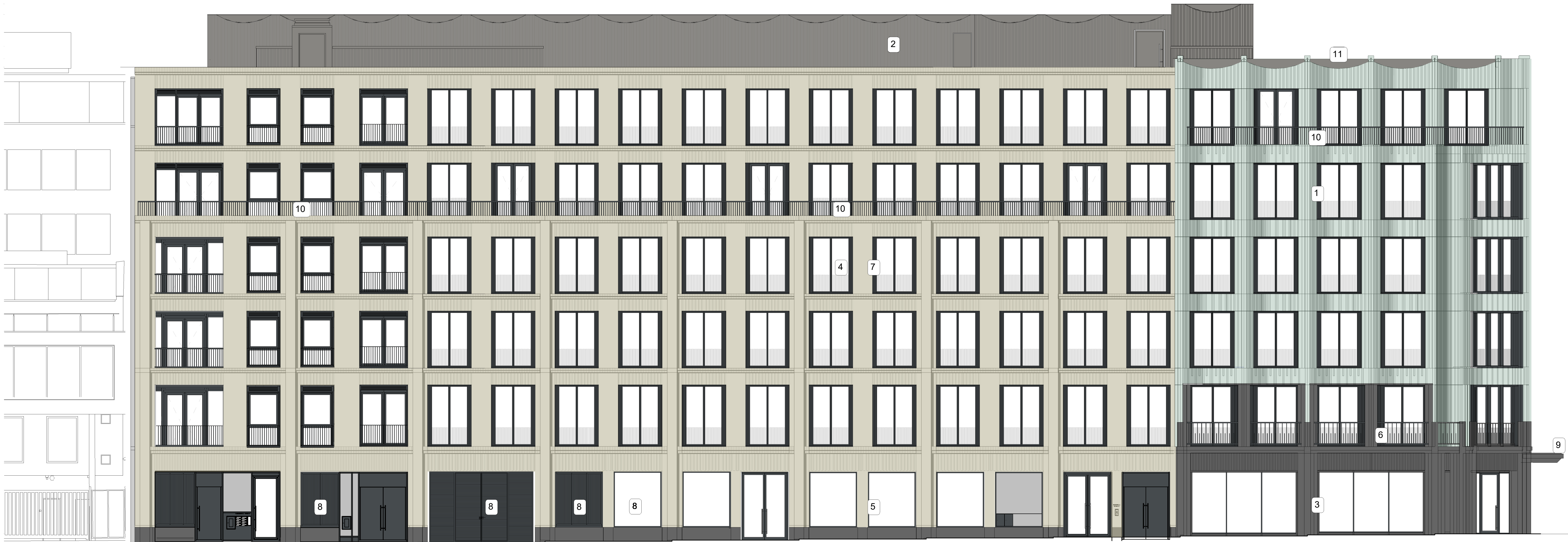
BRICK FACADE RESIDENCES DETAILS