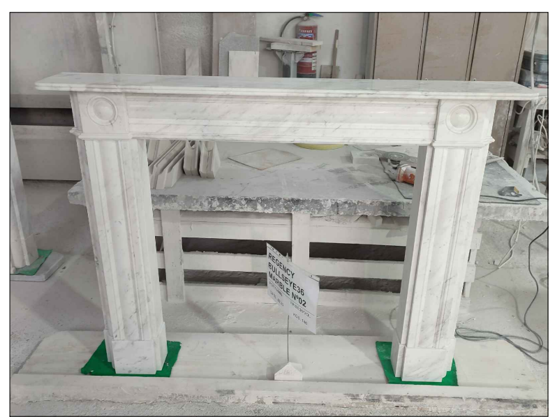
Proposed Fireplace - Regency Bullseye in Volakas Marble - to match existing