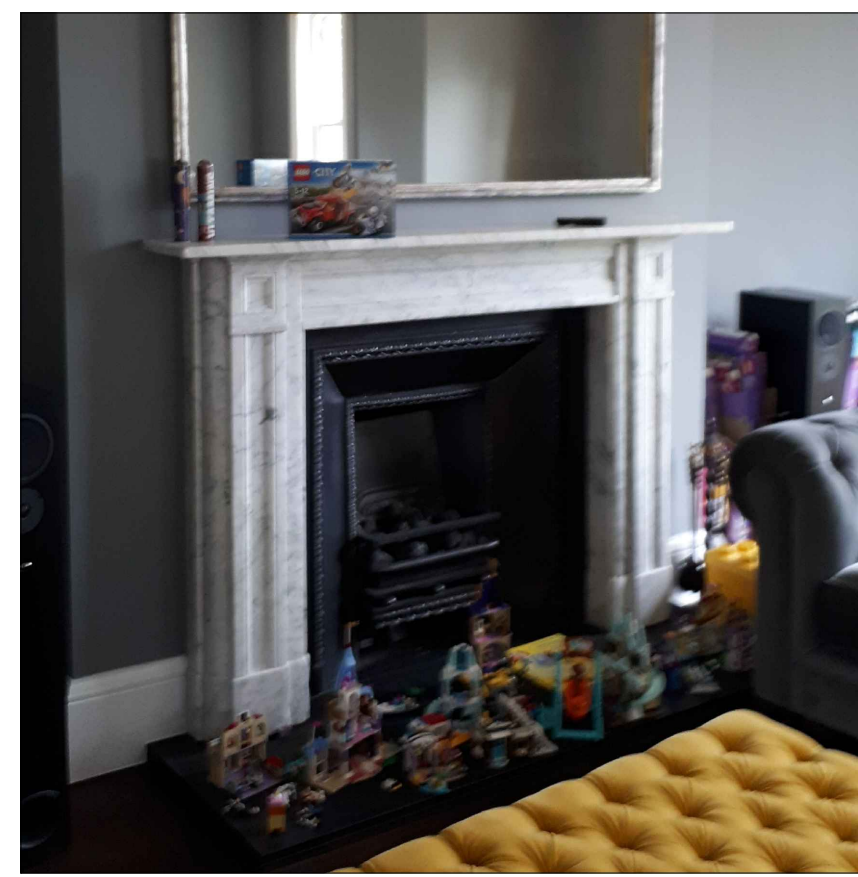
Existing Fireplace - GF Living Room