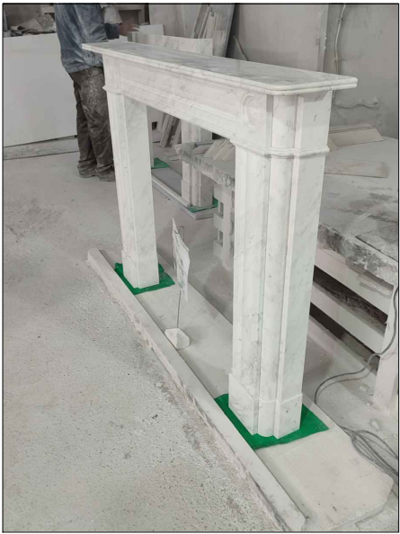
Proposed fireplace - Regency 40 in Volakas Marble - to match existing fireplace