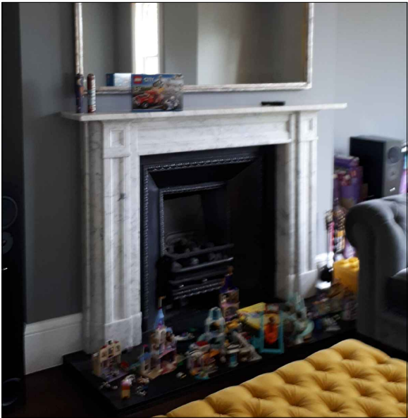
Existing fireplace- GF Living Room