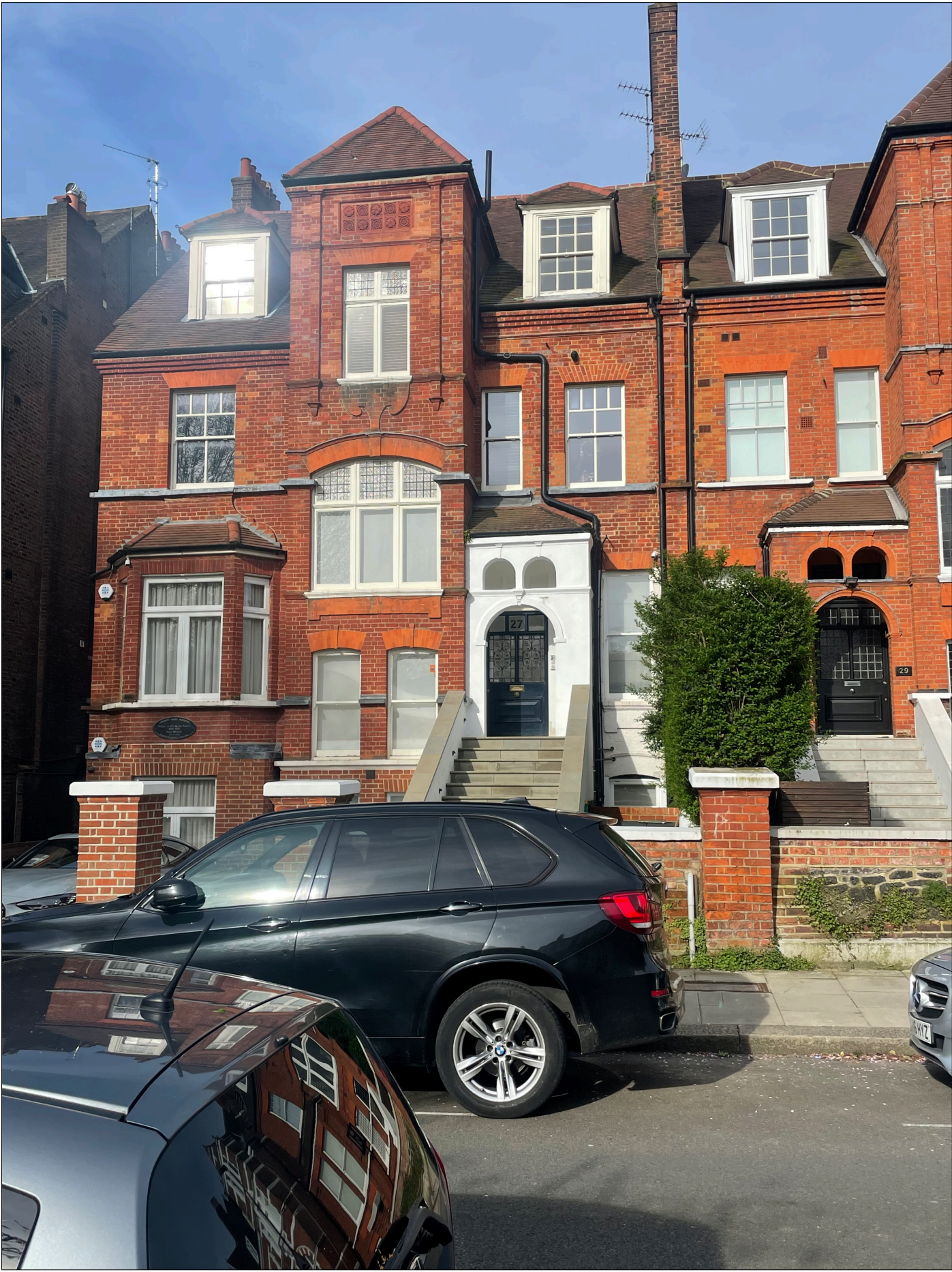
PHOTOGRAPH OF 27 MARESFIELD GARDENS