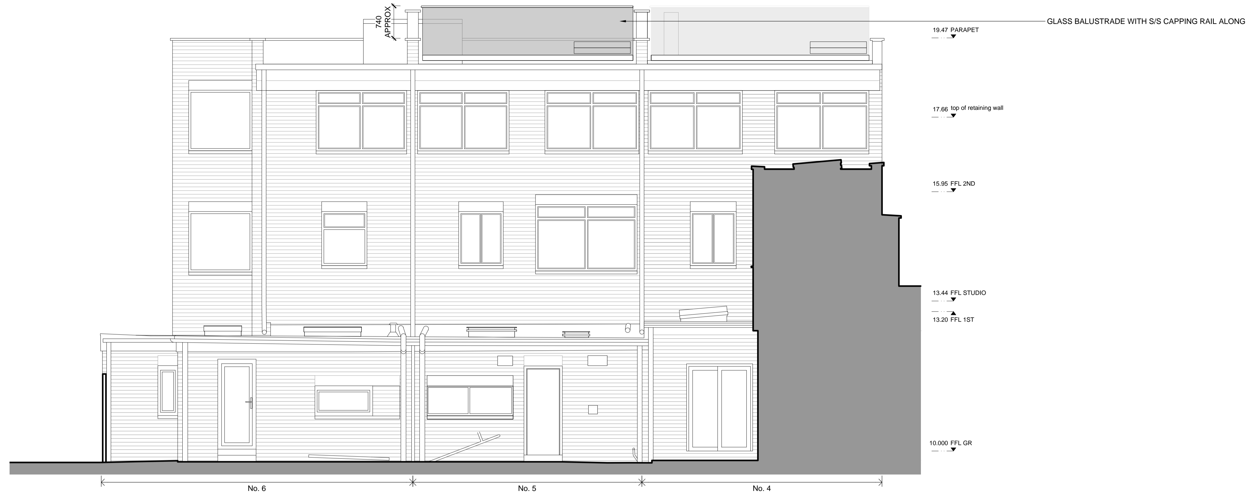
1 PROPOSED NORTH ELEVATION (REAR)