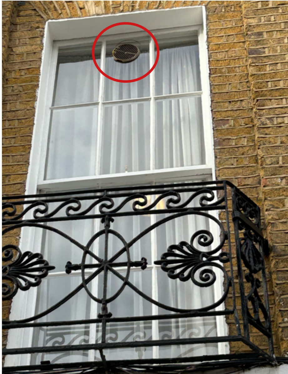
Remove existing ventilation grilles and replace with single glazing.