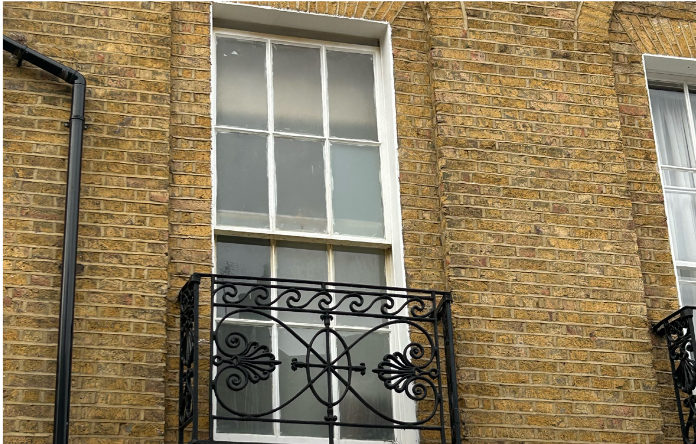
Existing obscured glazing to be replaced with clear glazing.