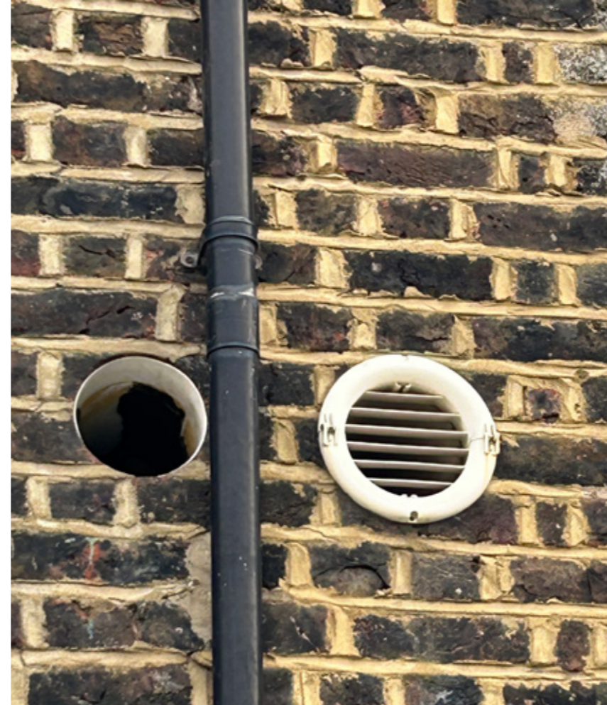
Replace all existing plastic grilles with metal powder coated grille colour to match the wall