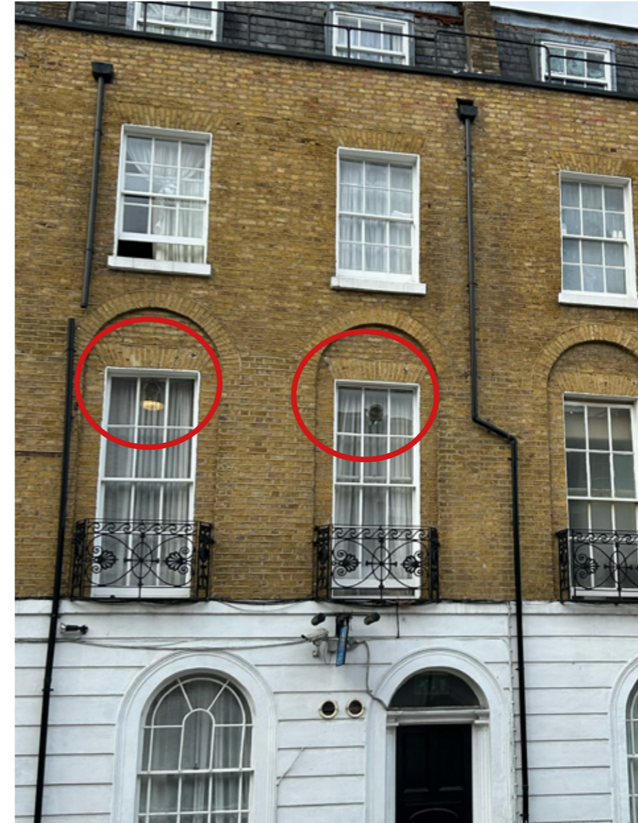
Location of 2x existing grilles to be replaced.