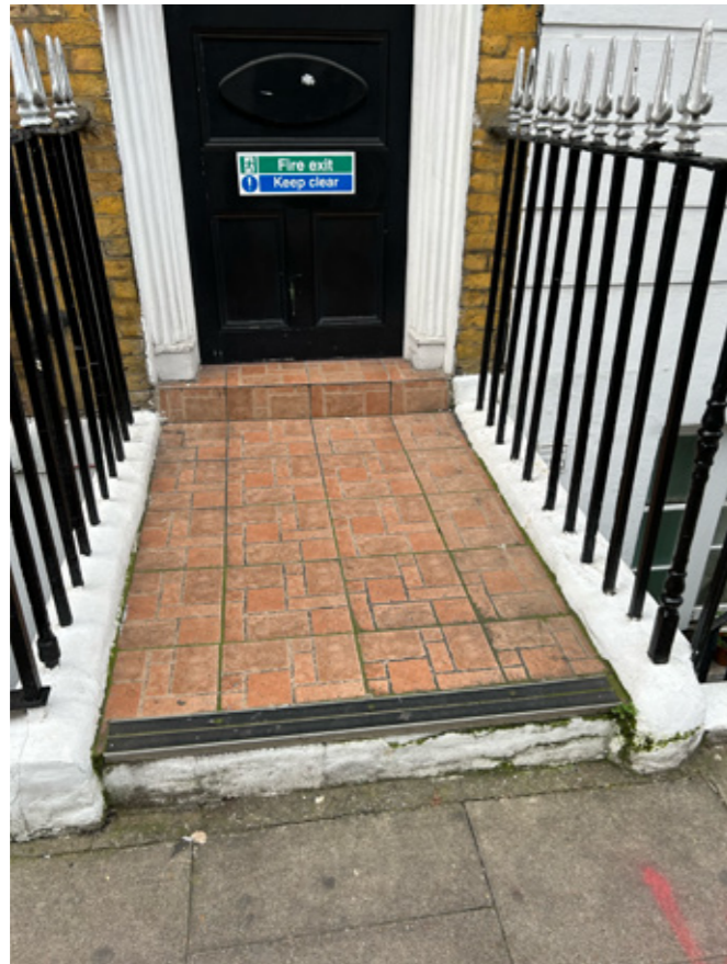
Existing Entrance Porch