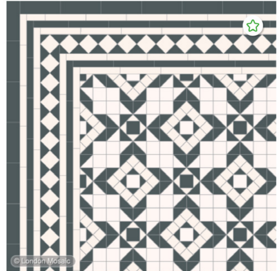
Example period entrance tile.

Black and White, a traditional design, with 50mm diamond border and seven lines. Composed predominantly of 50mm squares and triangles.