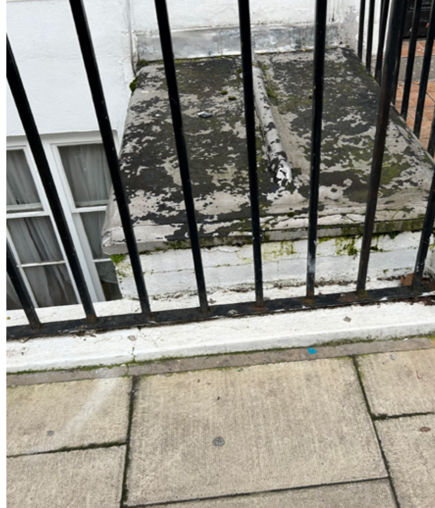
Replace existing flat roof with traditional lead roof