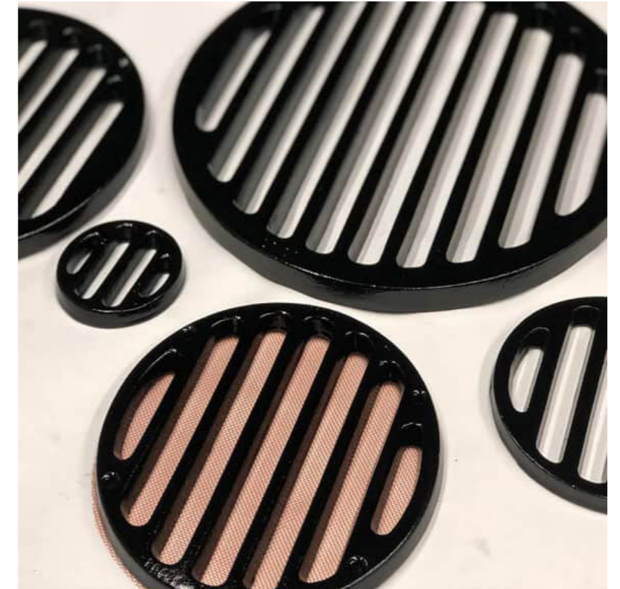
Example of the cast iron grille to be used to replace the plastic.