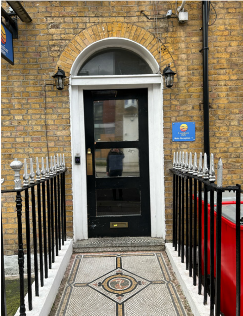
1. Existing Entrance Door