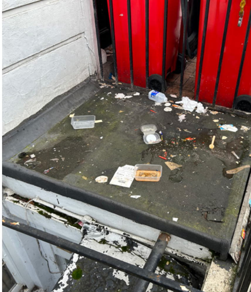
Replace existing flat roof with traditional lead roof