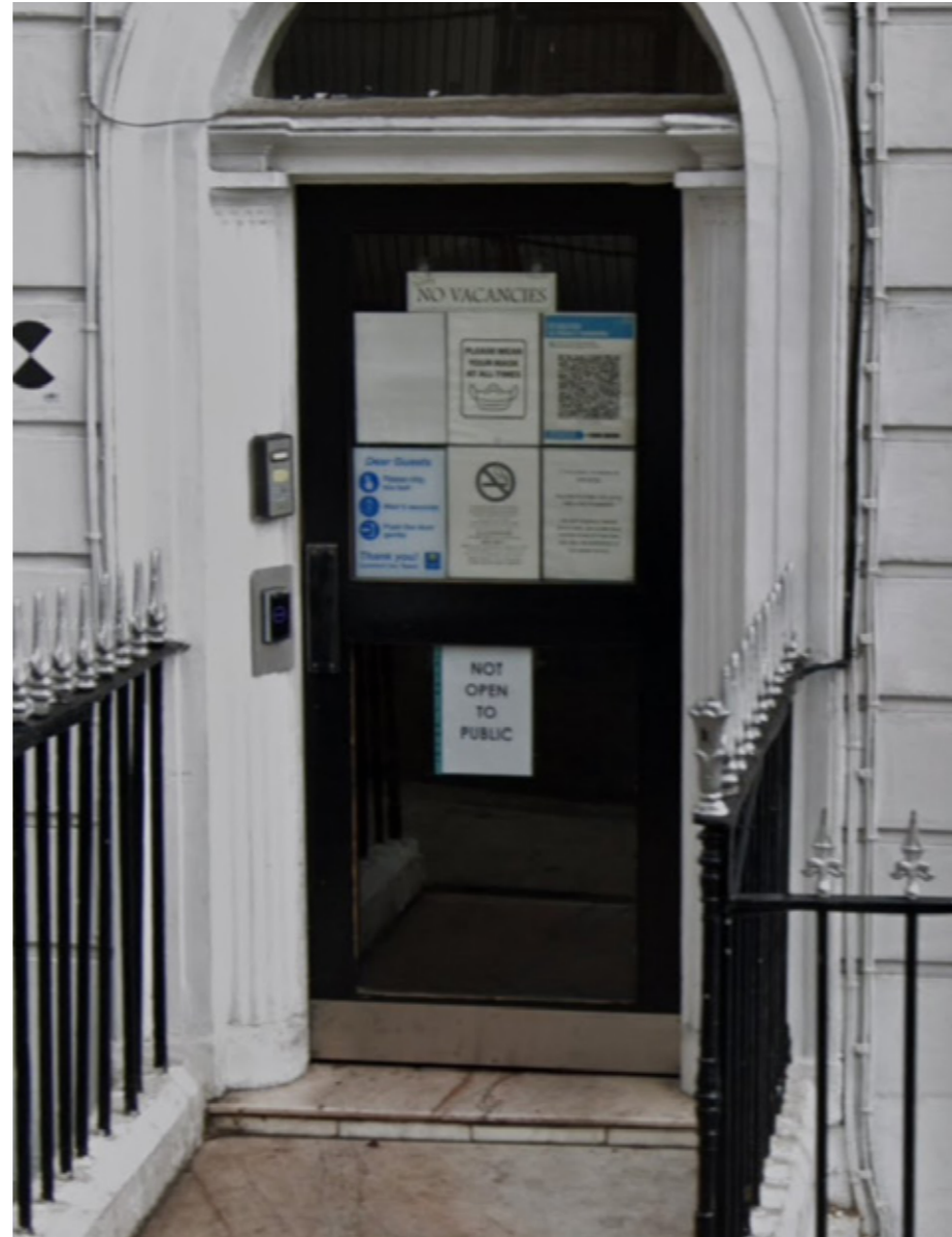
2. Existing Entrance Door