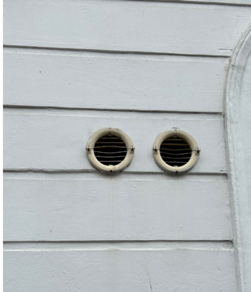
Replace all existing plastic grilles with metal powder coated grille colour to match the wall