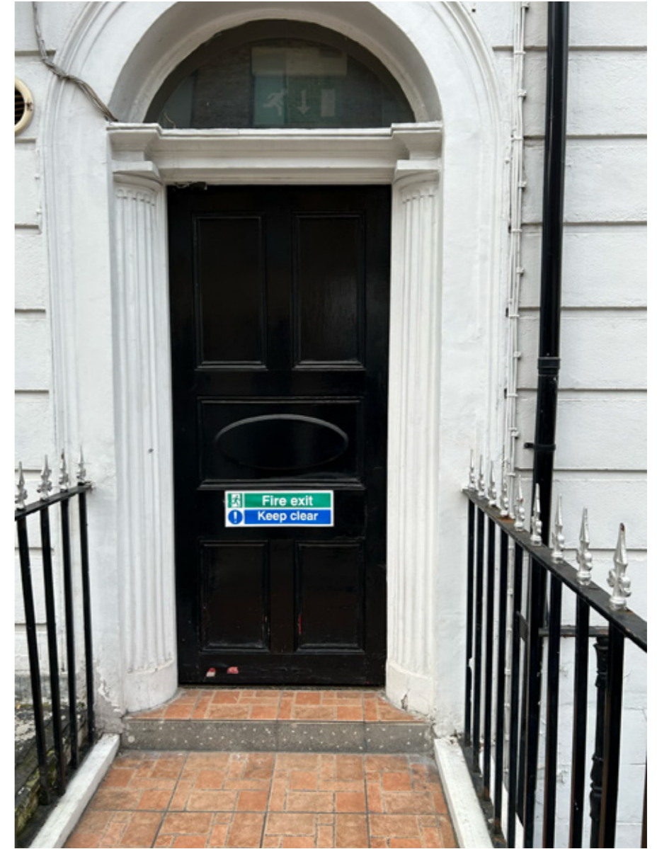
3. Existing Period Timber Door.

Doors 1 and 2 to be replaced and match existing period door 3.