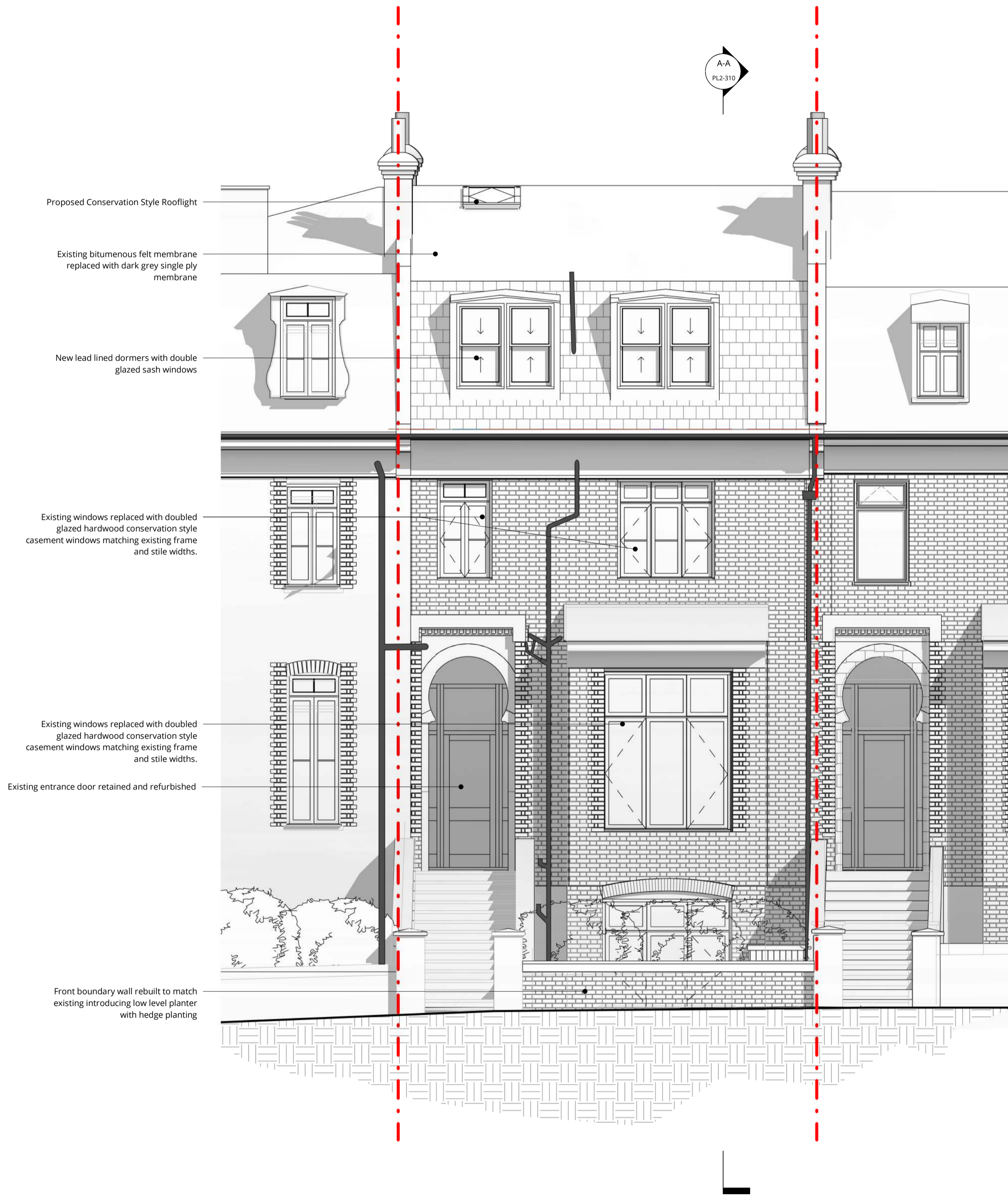
Proposed Front Elevation 1 : 50