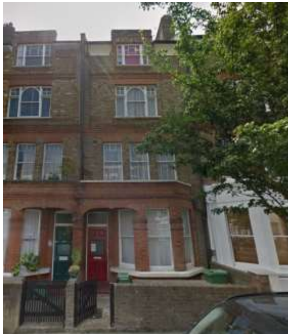
Photo 1 - Front Elevation