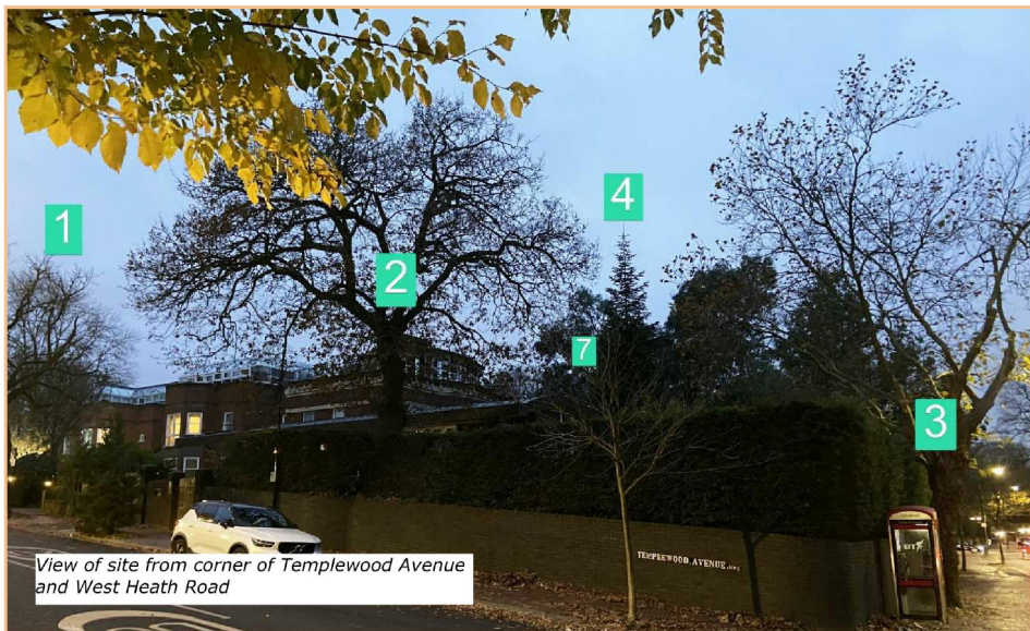
View of site from corner of Templewood Avenue and West Heath Road