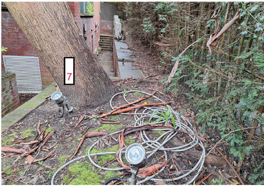
Base of tree 7 showing uncompleted windthrow