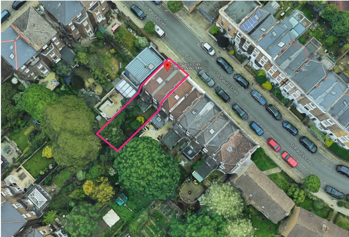
14 St Paul's Crescent