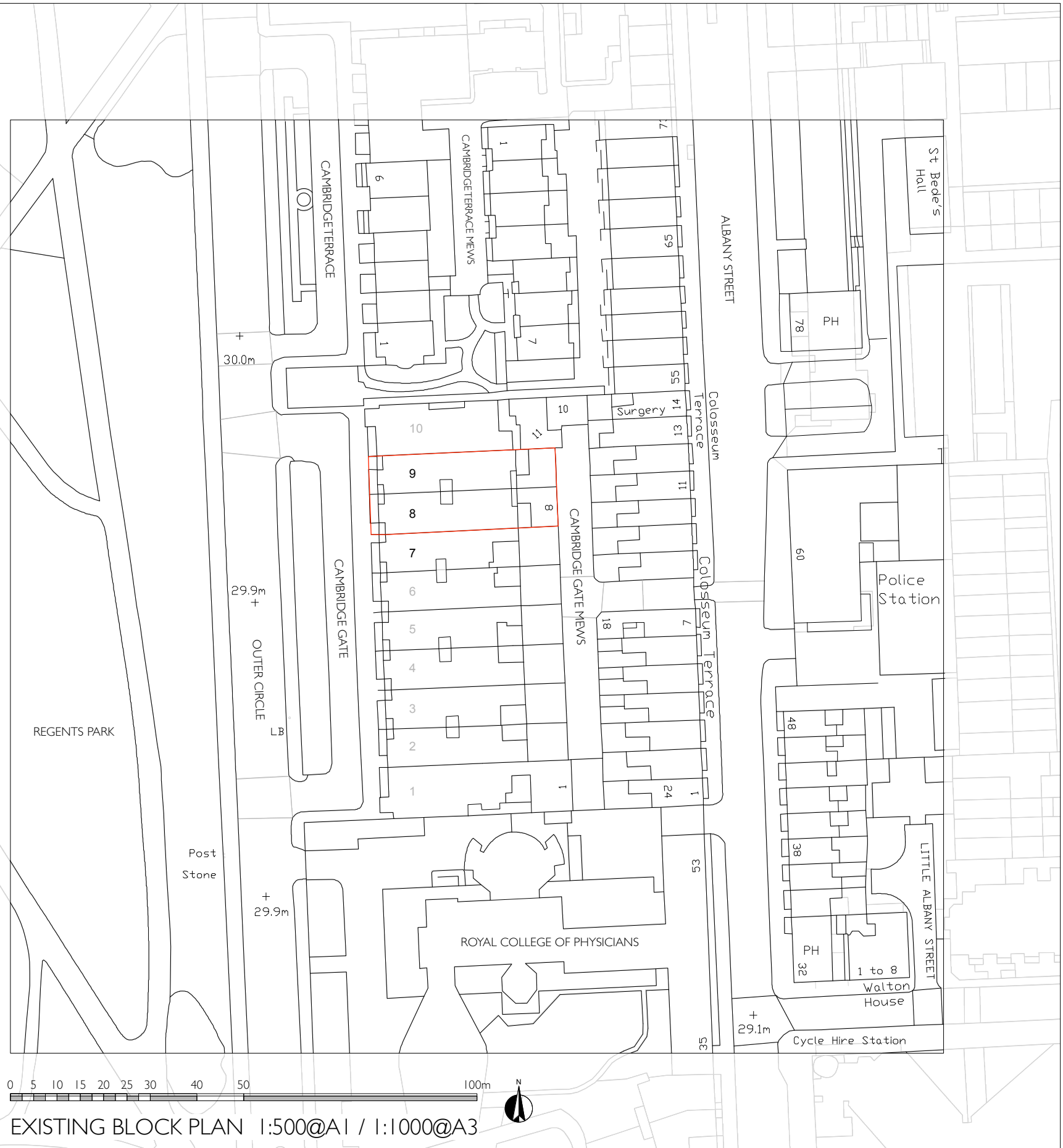
EXISTING BLOCK PLAN 1:500@A1 / 1:1000@A3