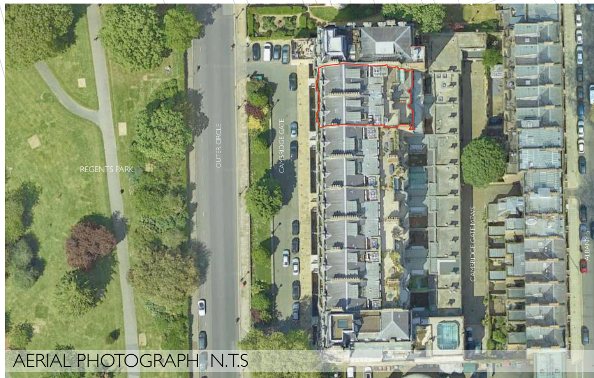
AERIAL PHOTOGRAPH N.T.S

Note: Although accessed via and addressed as Flat 5, 7 Cambridge Gate, that apartment's demise sits entirely within the original curtilage of 8 Cambridge Gate