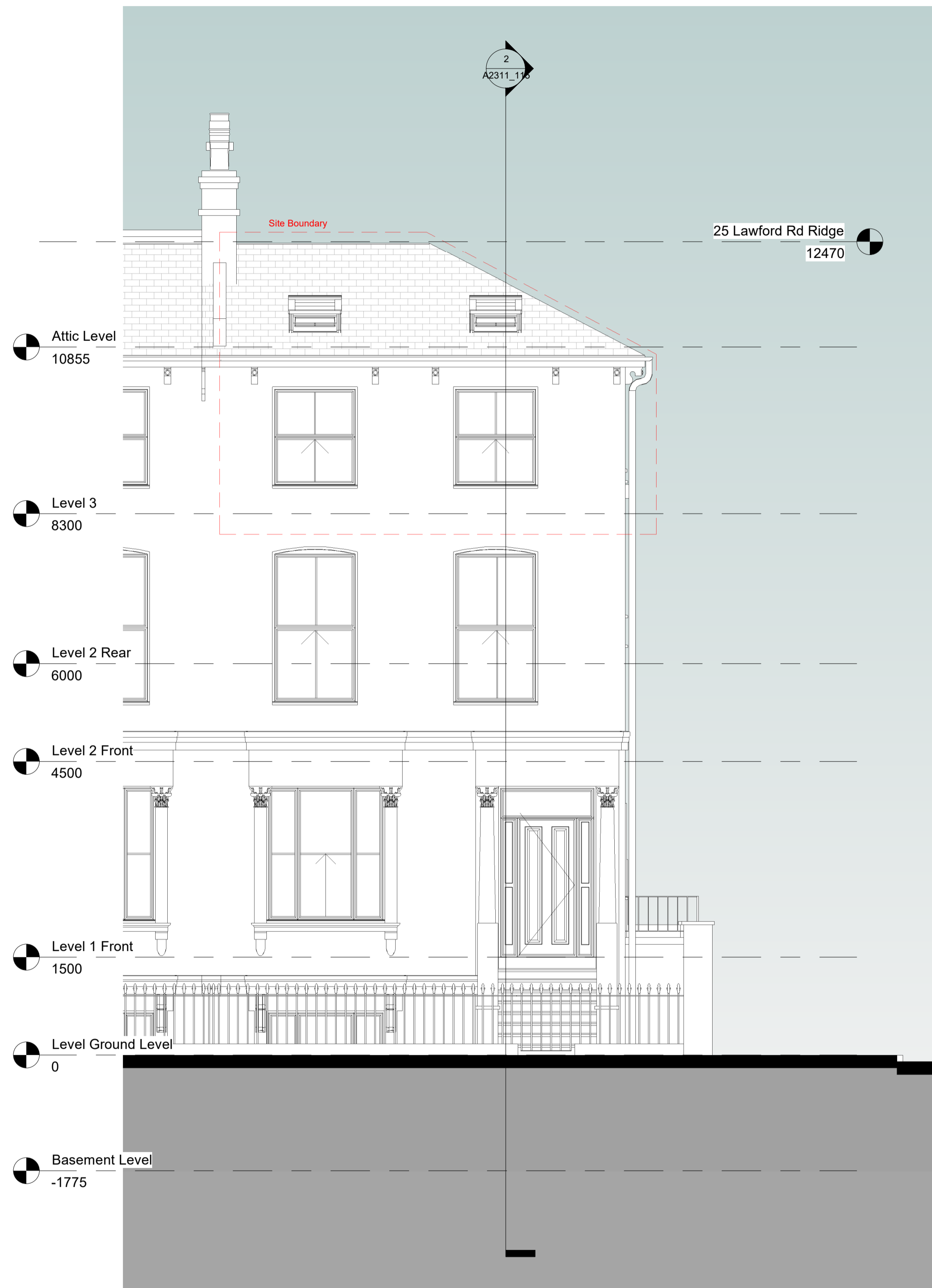
1 Proposed South Elevation 1 : 50