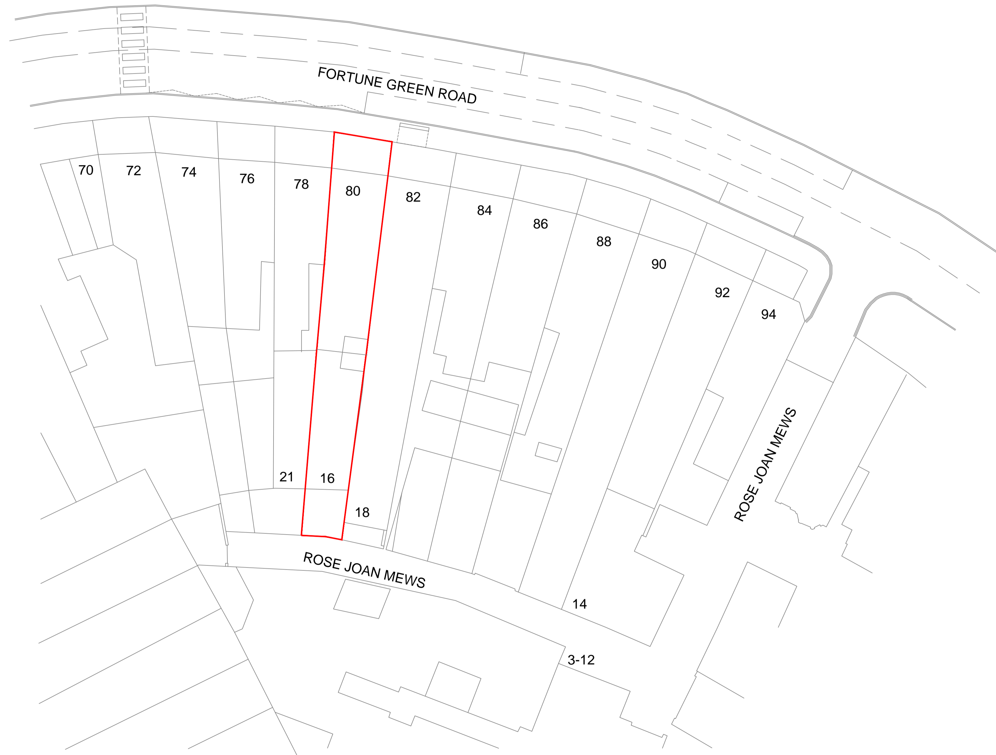
BLOCK PLAN scale 1:200