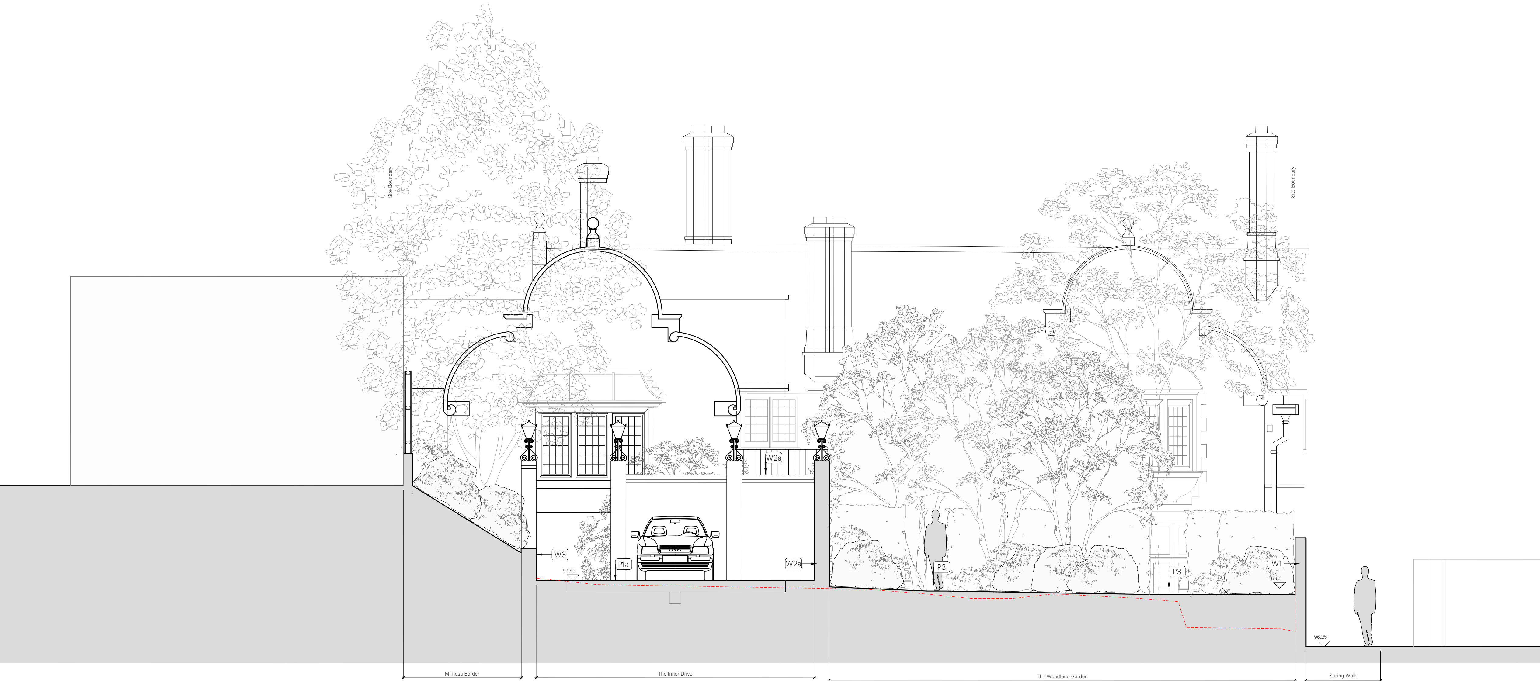
1 PROPOSED SECTION D 1:50 @ A1