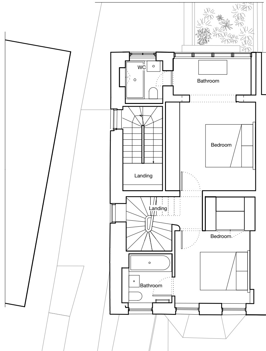
1 Proposed First Floor Scale: 1:100