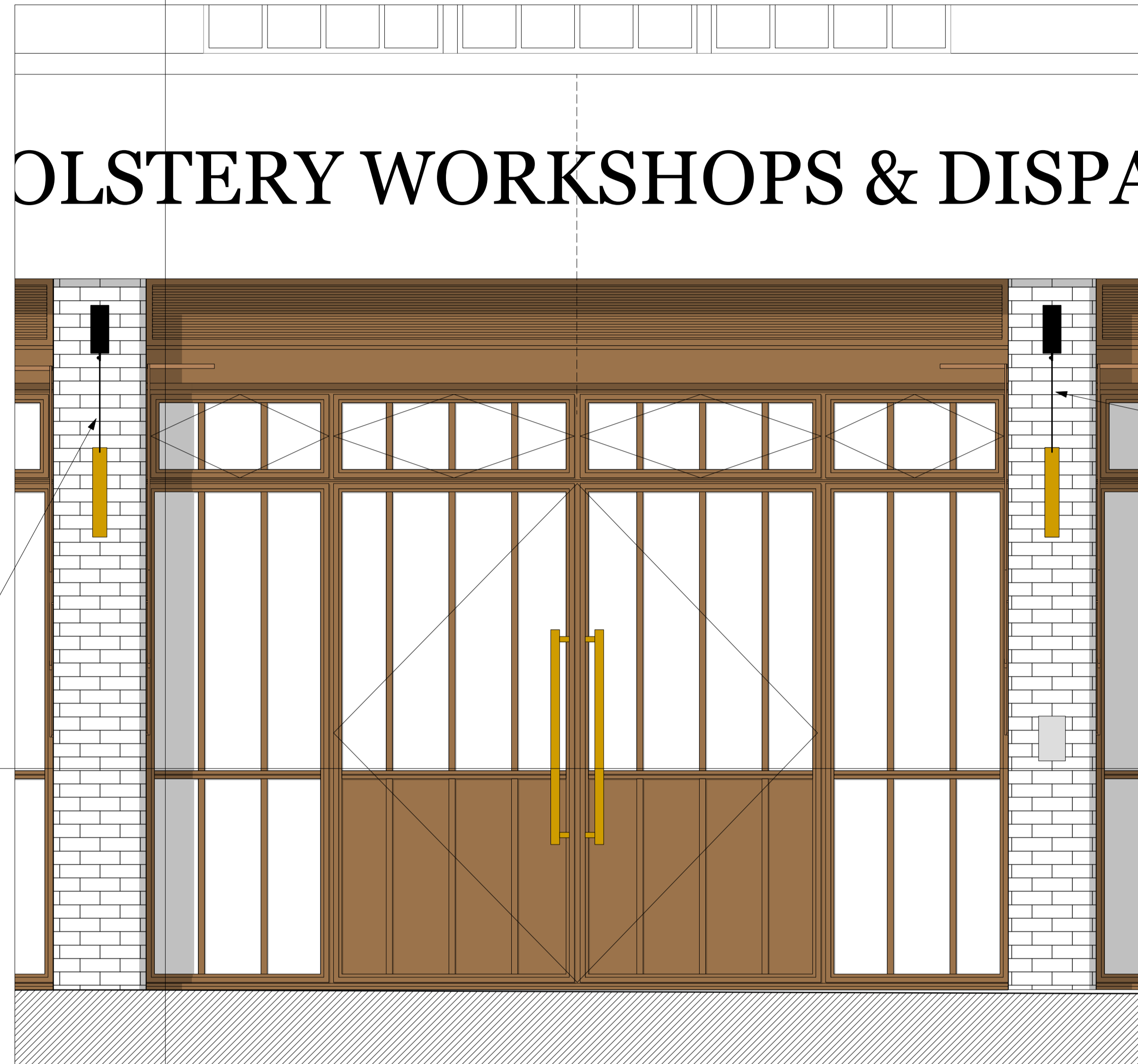
02 Alfred Mews Elevation Scale: 1:20

New Hanging Sign Material: Painted Metal Background Colour: 85% Black (RAL 9005) Text/Logo Colour: Pure White (RAL 9010)