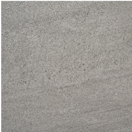
DXF KTL 03