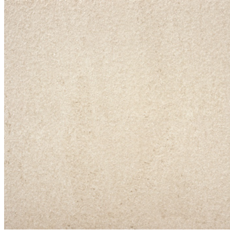
DXF KTL 02