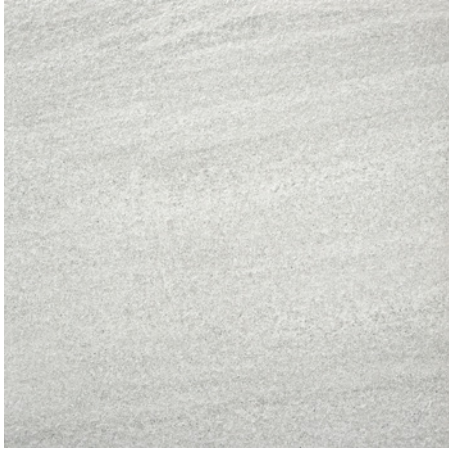
DXF KTL 01