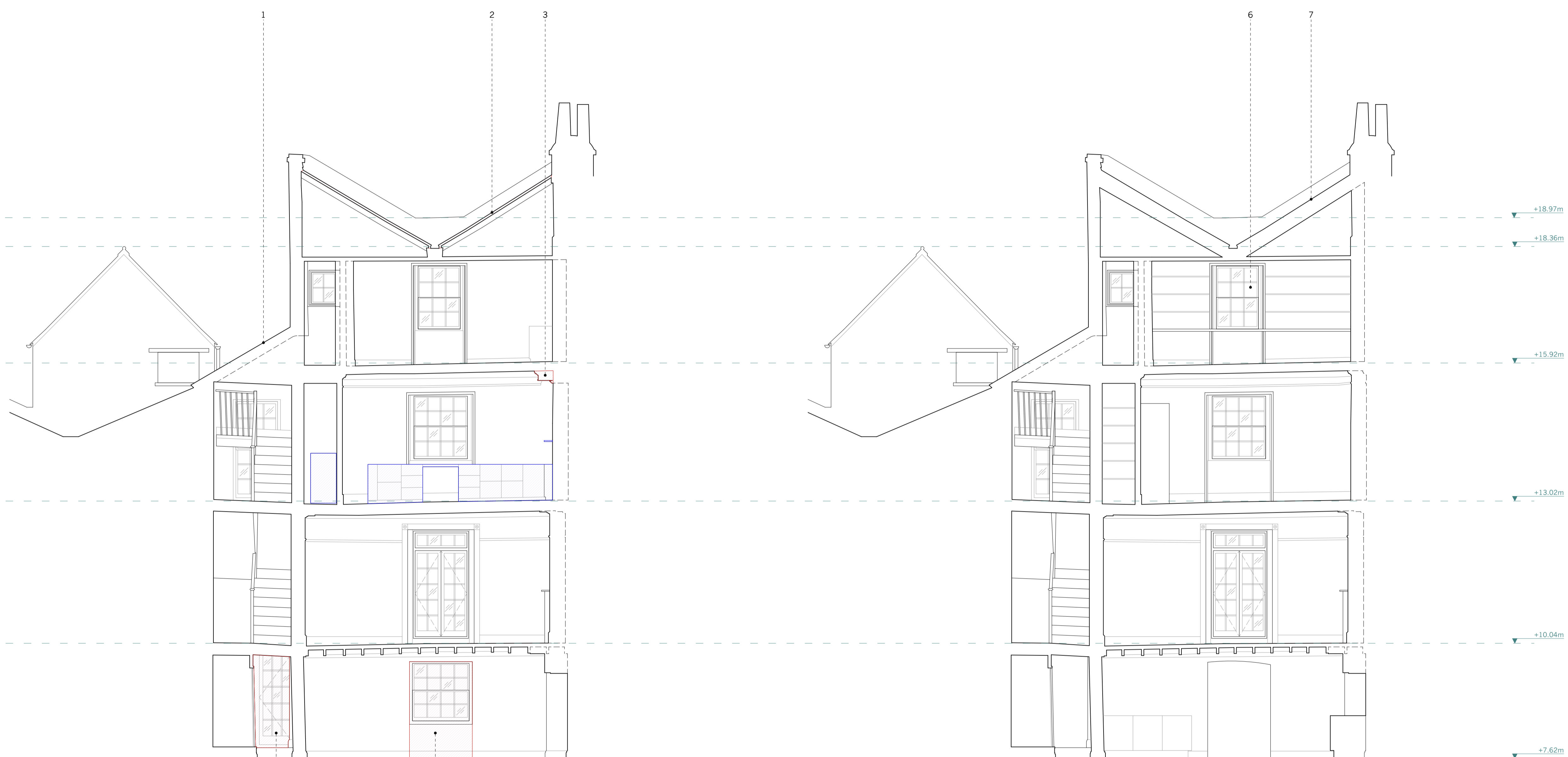
Existing Section BB