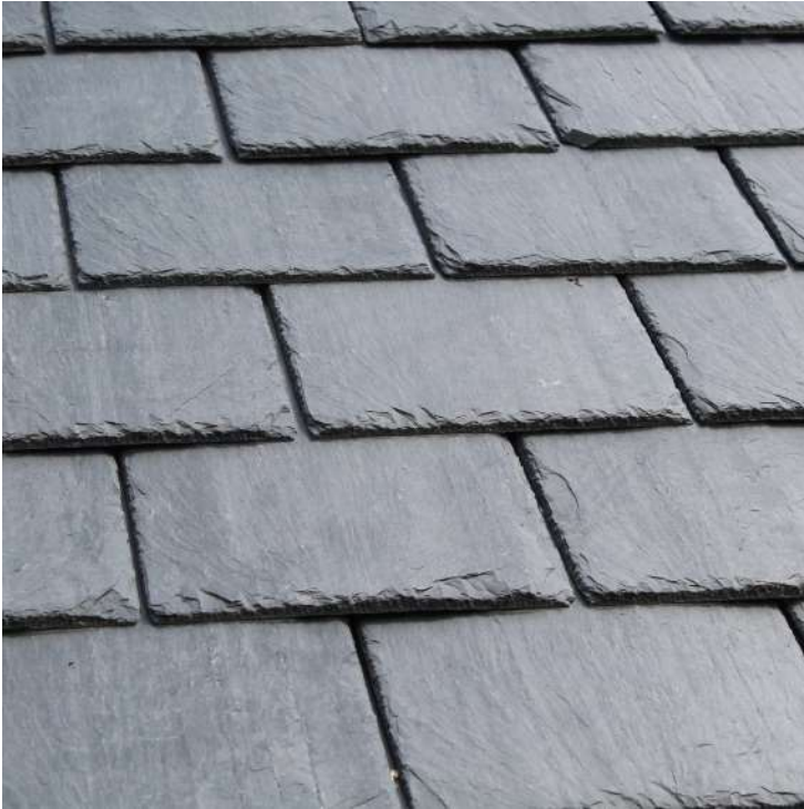
Image 04 - Slates