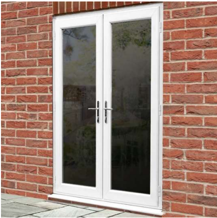
Image 08 – Rear doors to garden and terrace. – White Upvc – Indicative only profile as per elevations.