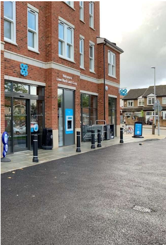
Image 07 – Aluminium framed shopfront Ral 7016 (indicative image)