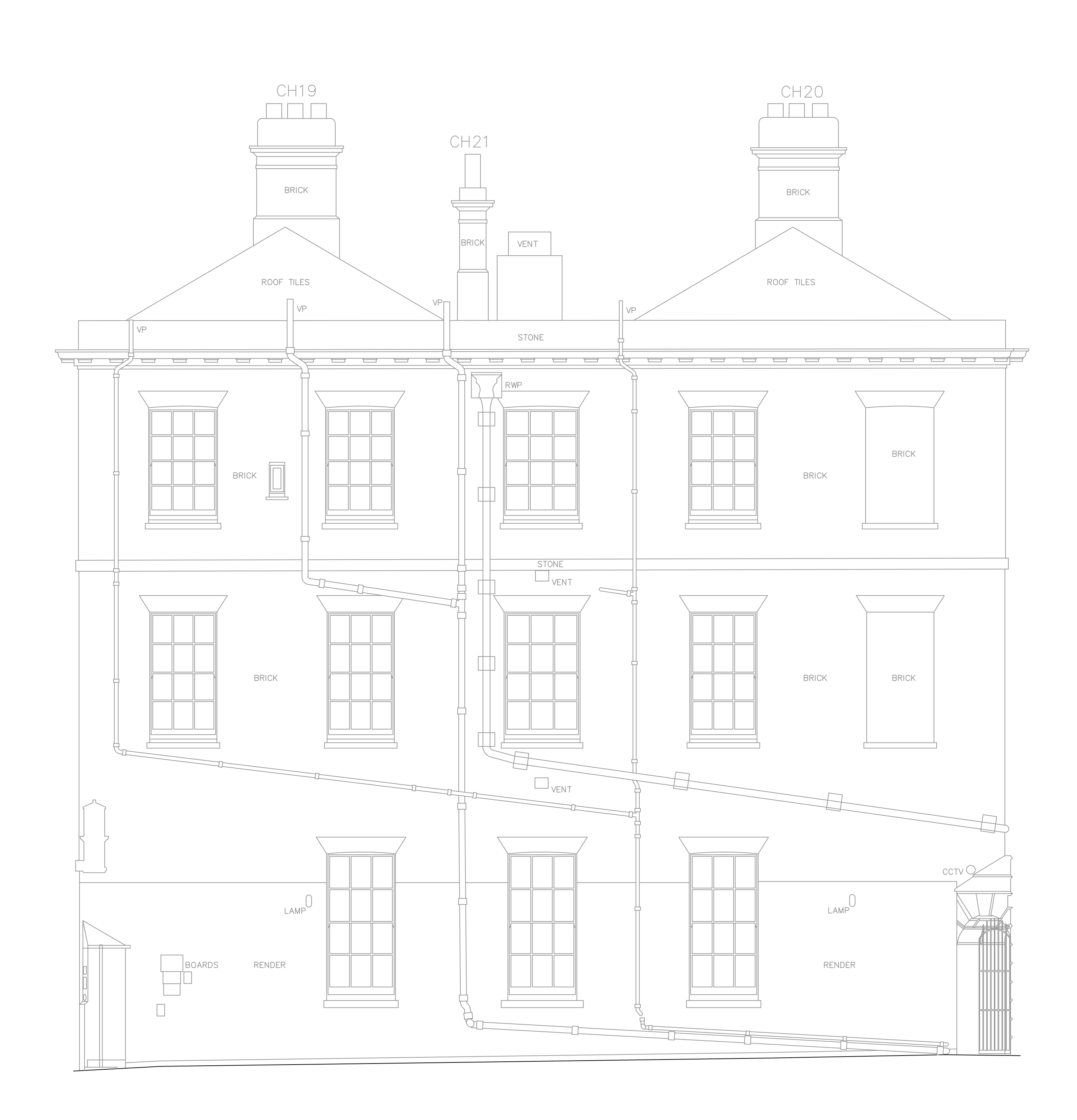
DATUM=17.00m ELEVATION 4