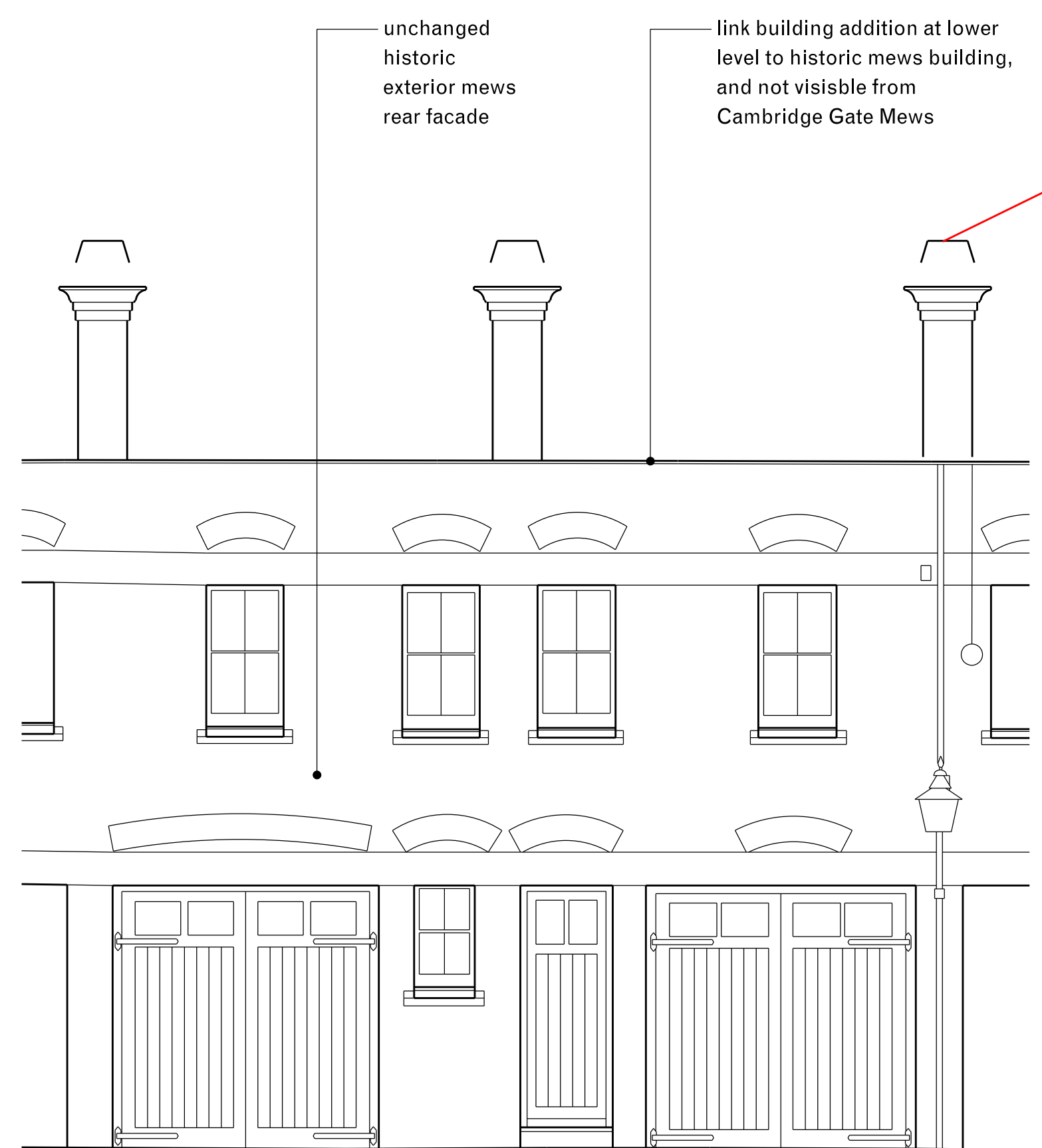
01 Front elevation Scale 1:50

unchanged historic exterior mews rear facade