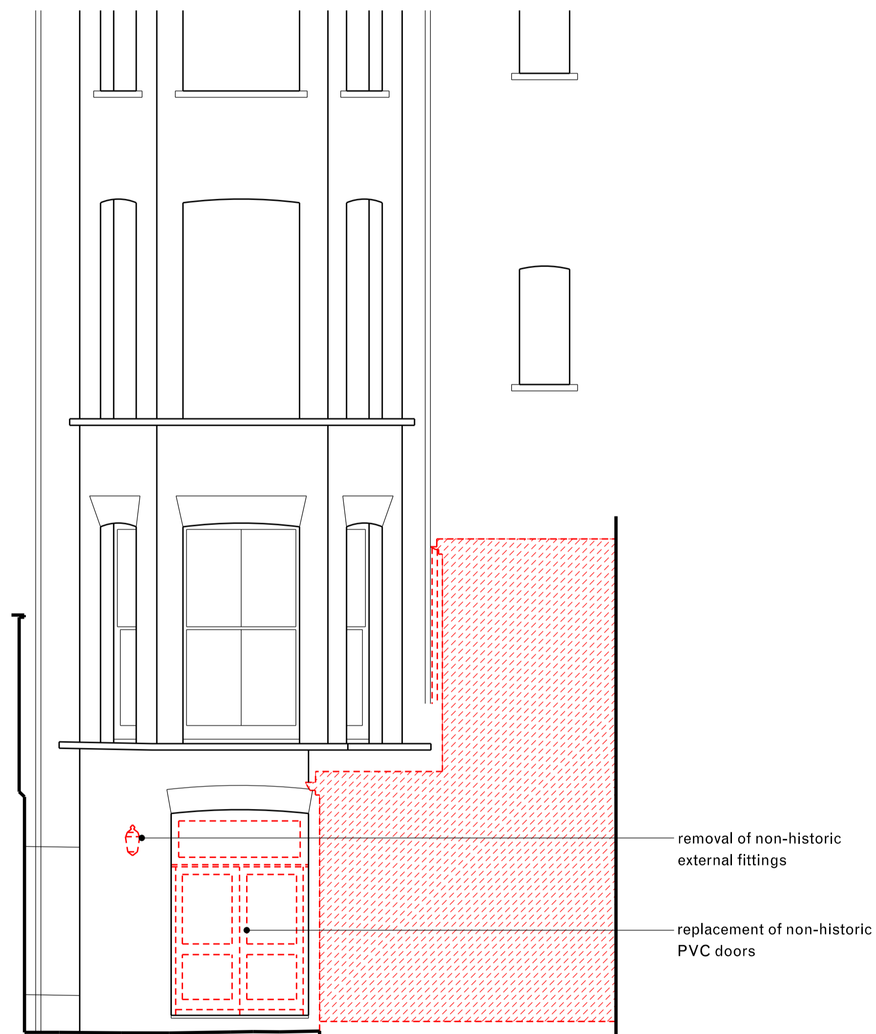
01 West elevation Scale 1:50