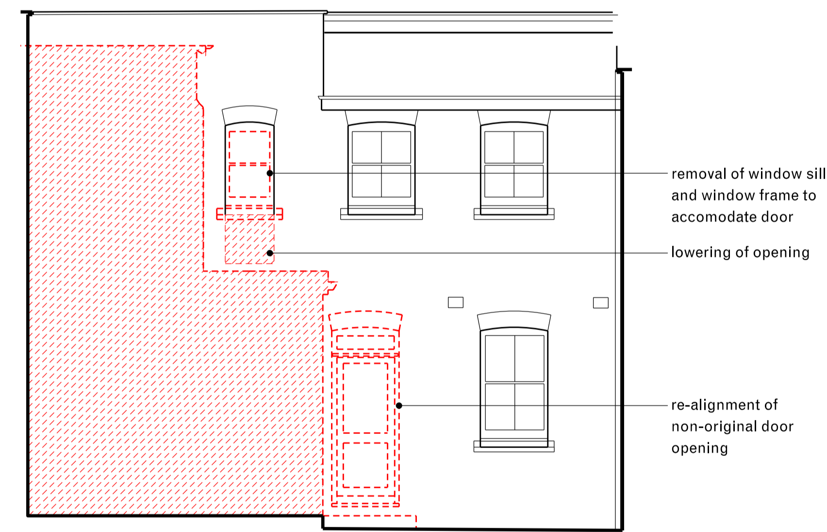
03 East elevation Scale 1:50