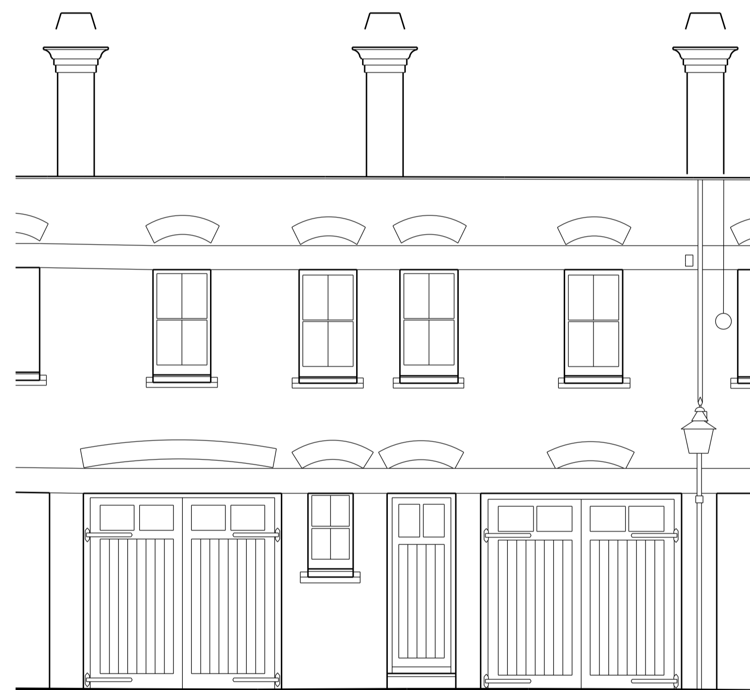
02 Mews elevation Scale 1:50