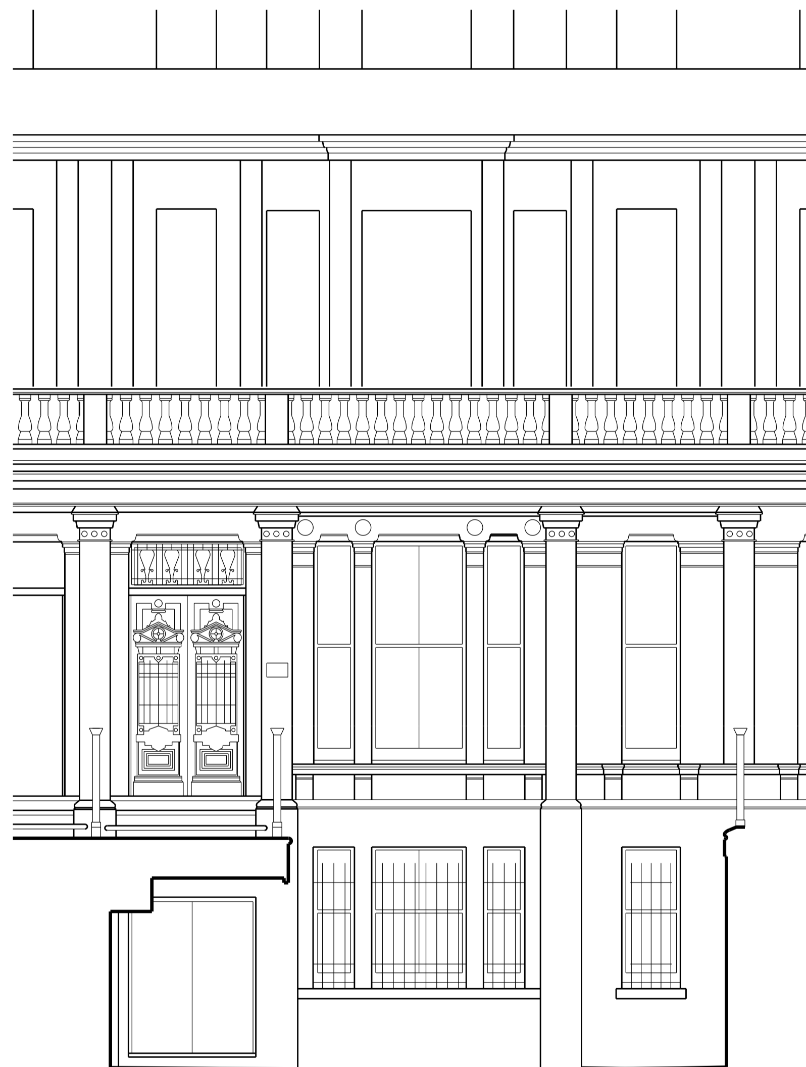
01 Front elevation Scale 1:50