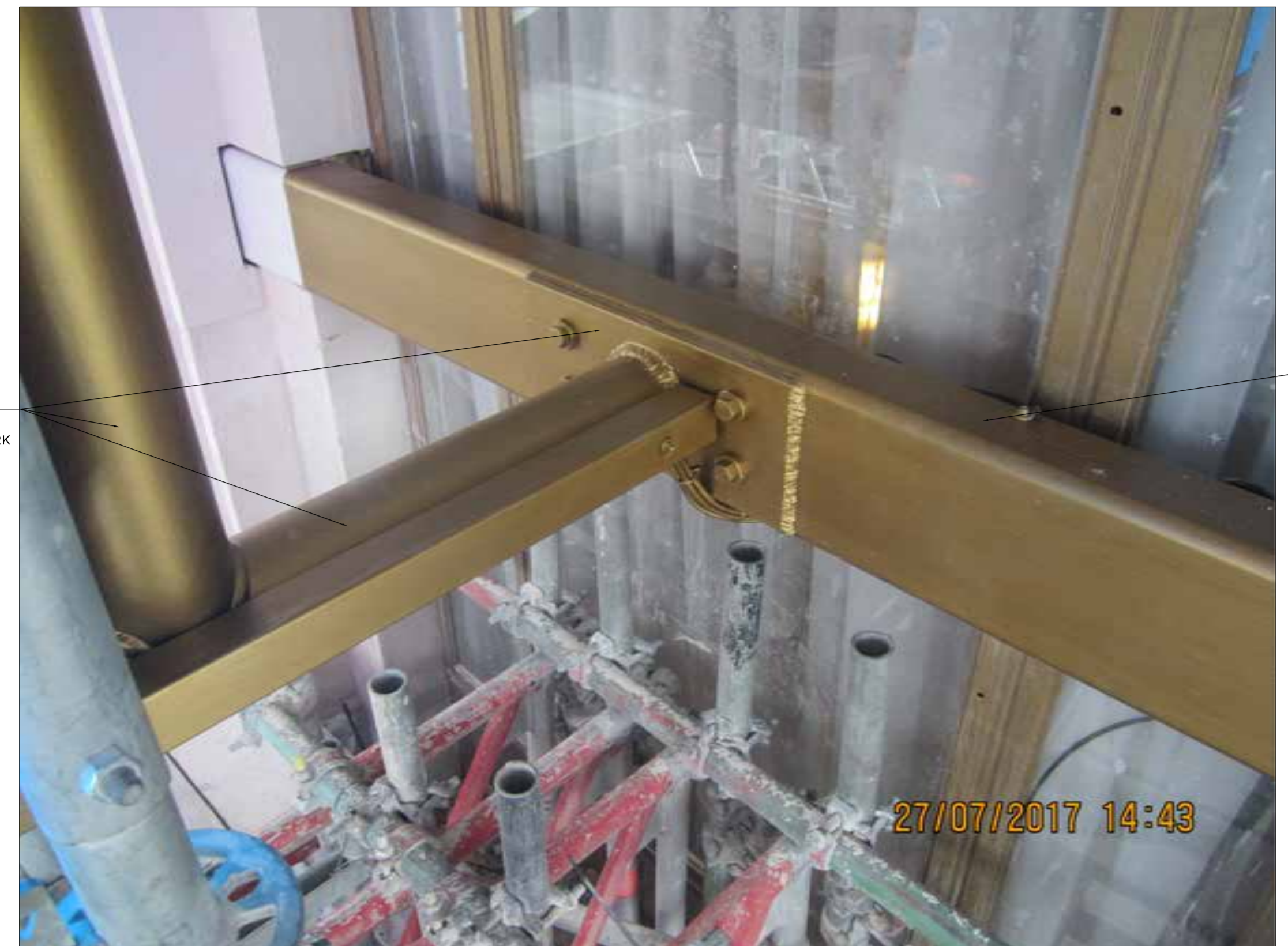
EXISTING PHOTO NOTING STEELWORK TO BE FIXED TO (NTS)