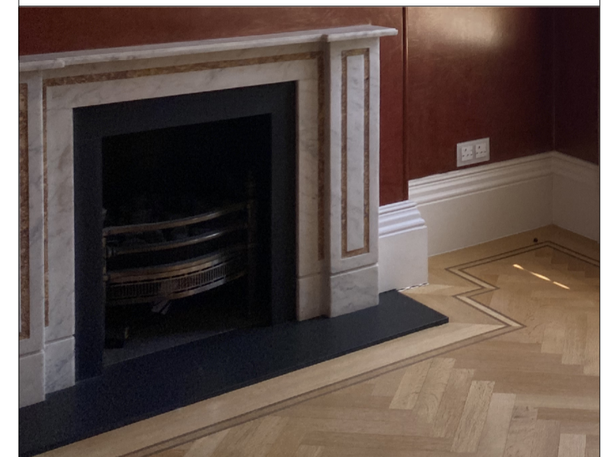
RECEPTION 01 PHOTO