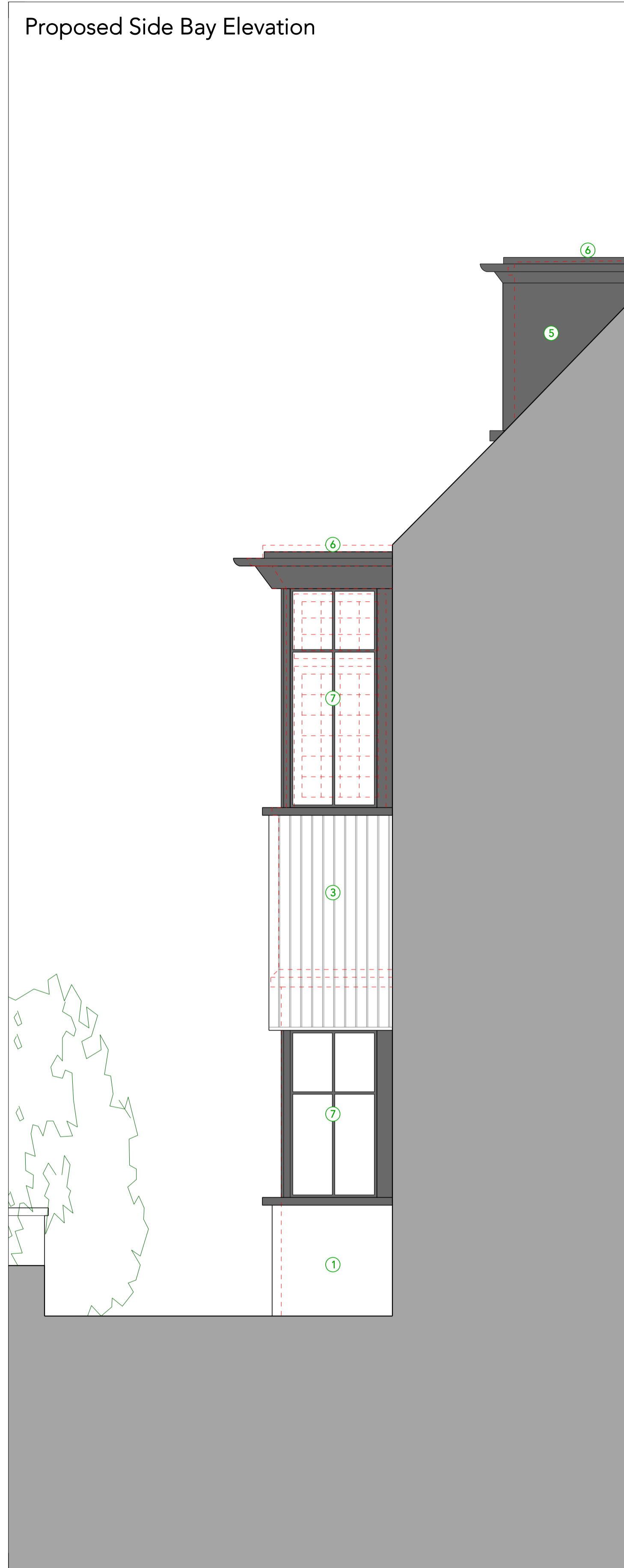
Proposed Side Bay Elevation