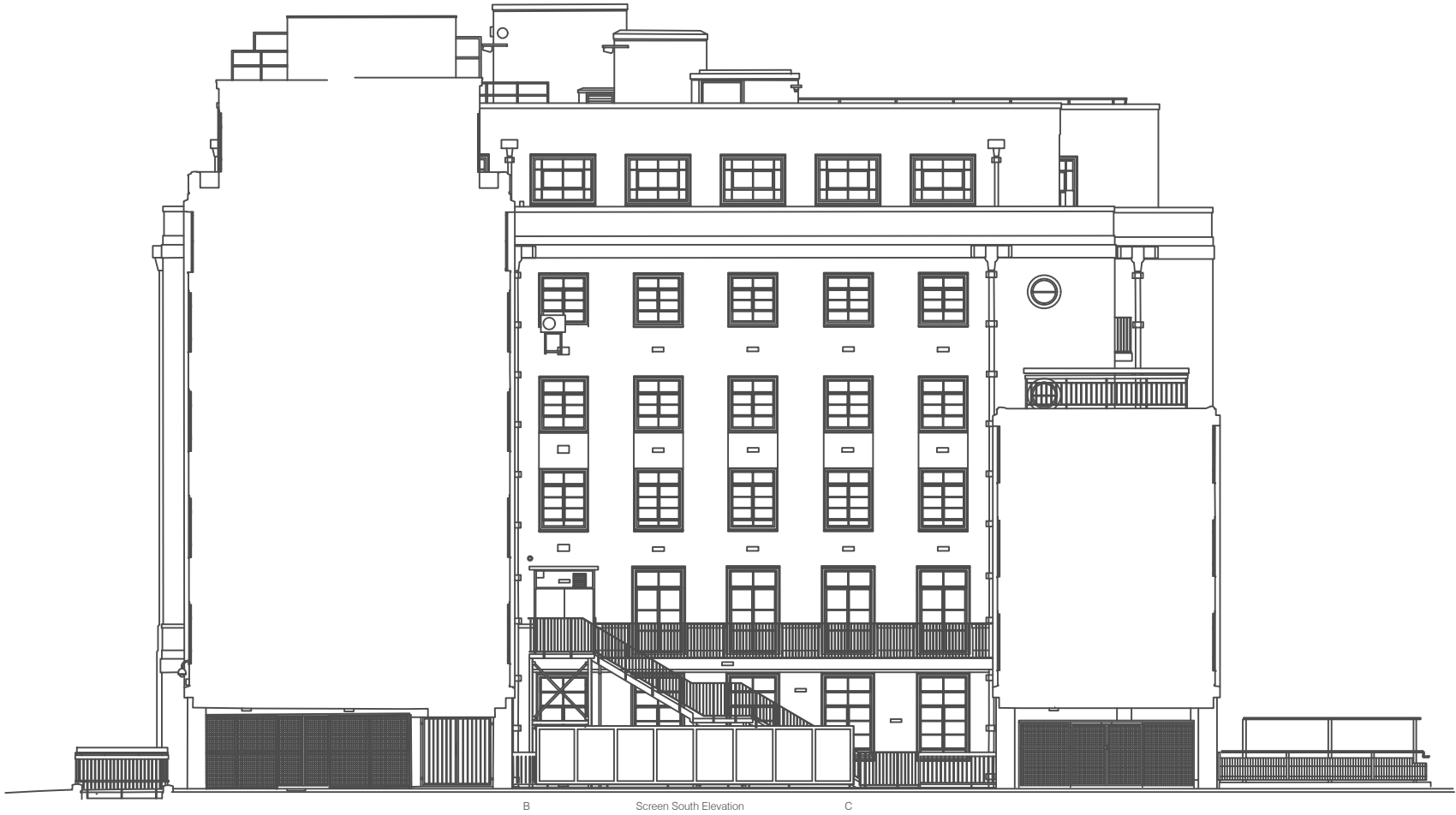
Section AA through BBK Extension Building (EXT) showing BCB South Elevation and Screen