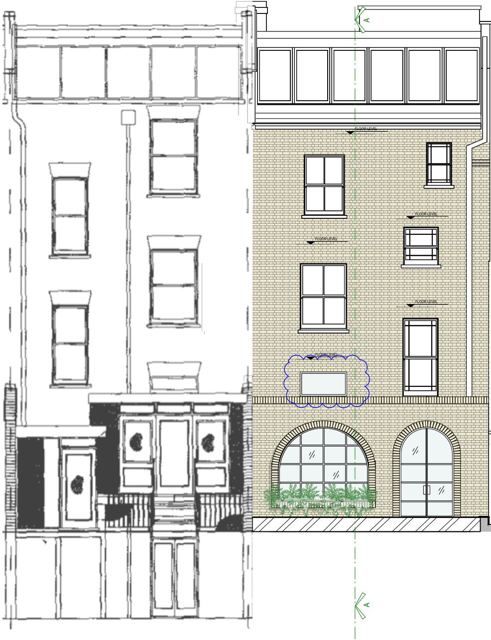
53 SOUTH HILL PARK Drawing taken from 2009/3830/P from Camden council website