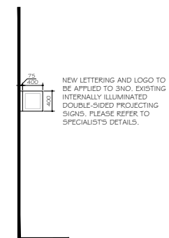
PROPOSED TYPICAL PROJECTING SIGN SIDE ELEVATION SCALE 1:50@A1