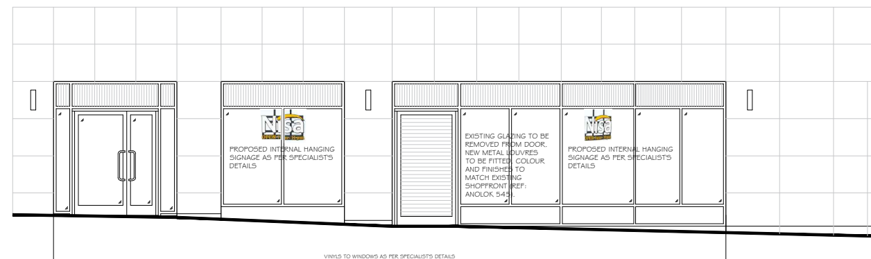
PROPOSED SHOPFRONT ELEVATION SCALE 1:50@A1