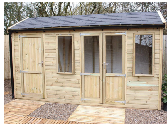
PROPOSED GARDEN SHED