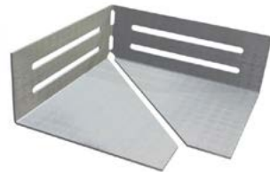
Angled Connector (90 degree)