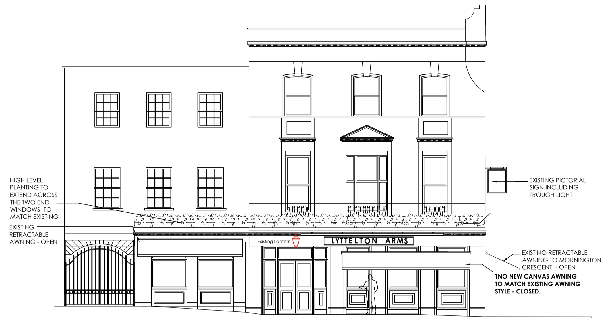
PROPOSED ELEVATION TO MORNINGTON CRESCENT AWNINGS OPEN (1:100)