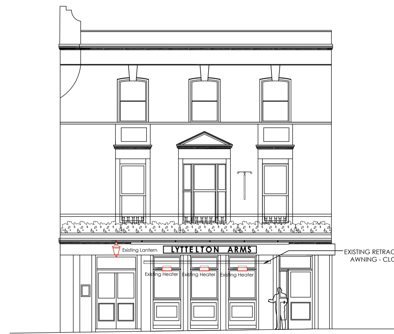
EXISTING ELEVATION TO CAMDEN HIGH STREET AWNINGS CLOSED (1:100)