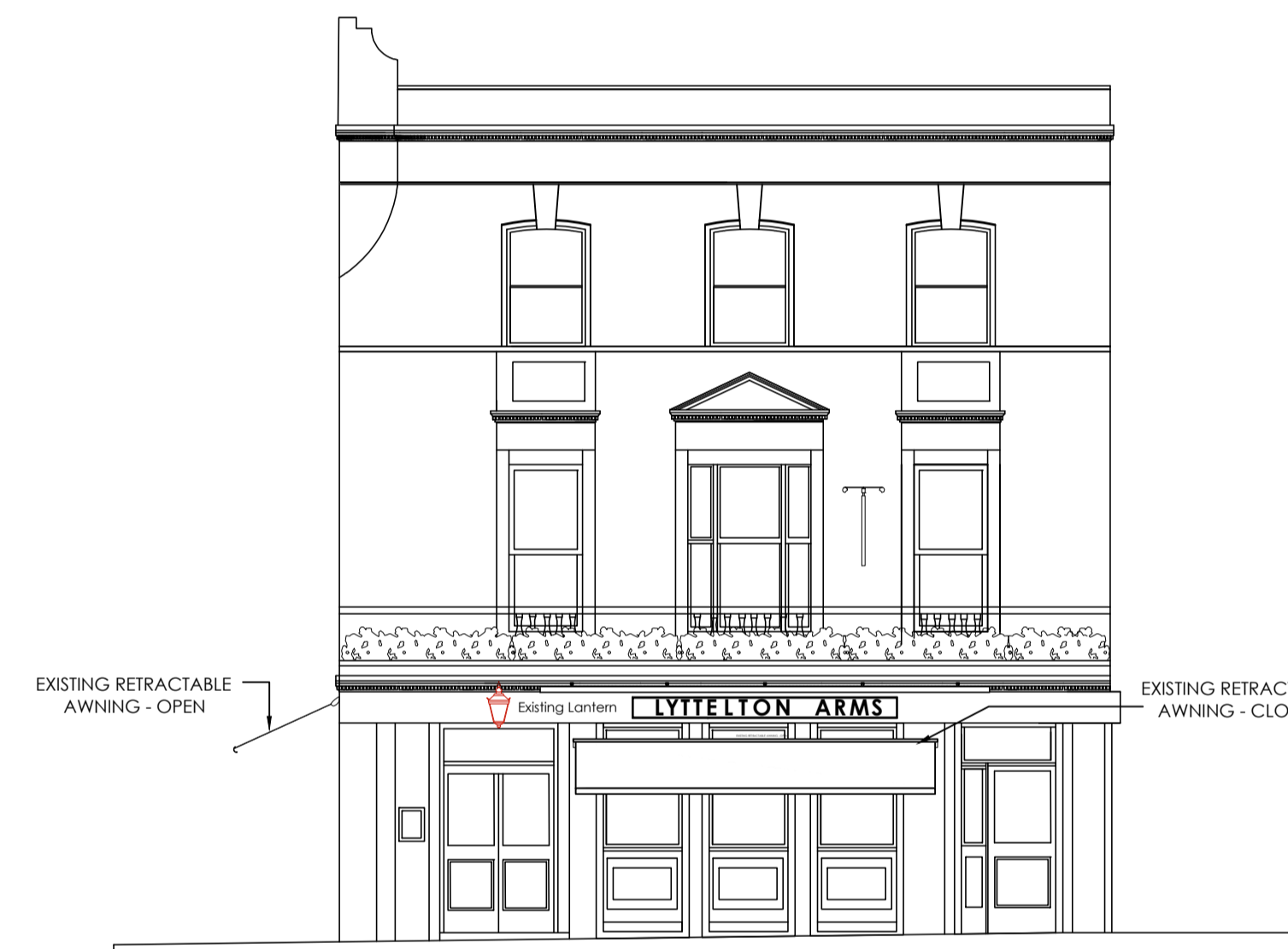
EXISTING ELEVATION TO CAMDEN HIGH STREET AWNINGS OPEN (1:100)