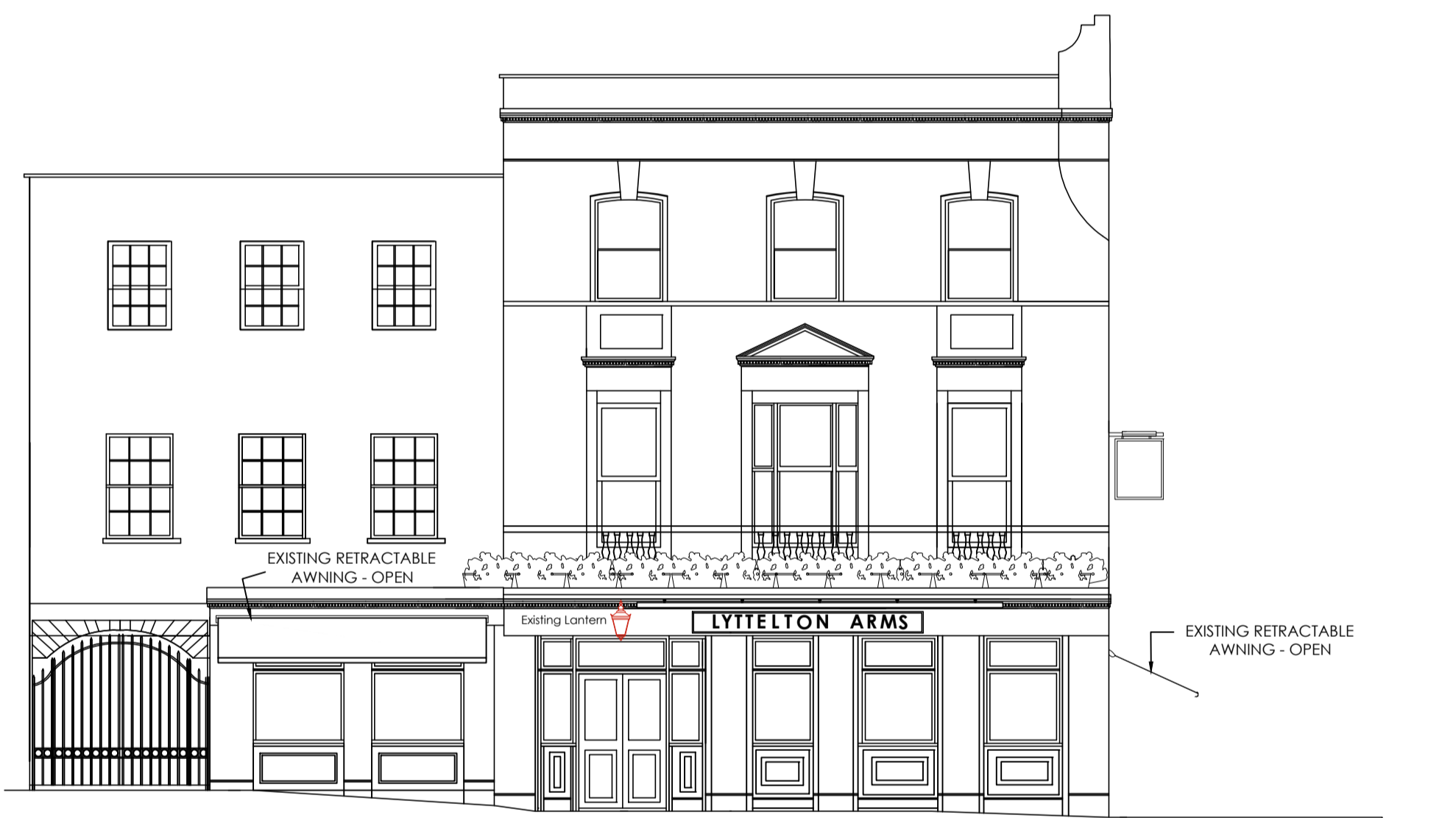
EXISTING ELEVATION TO MORNINGTON CRESCENT AWNINGS OPEN (1:100)