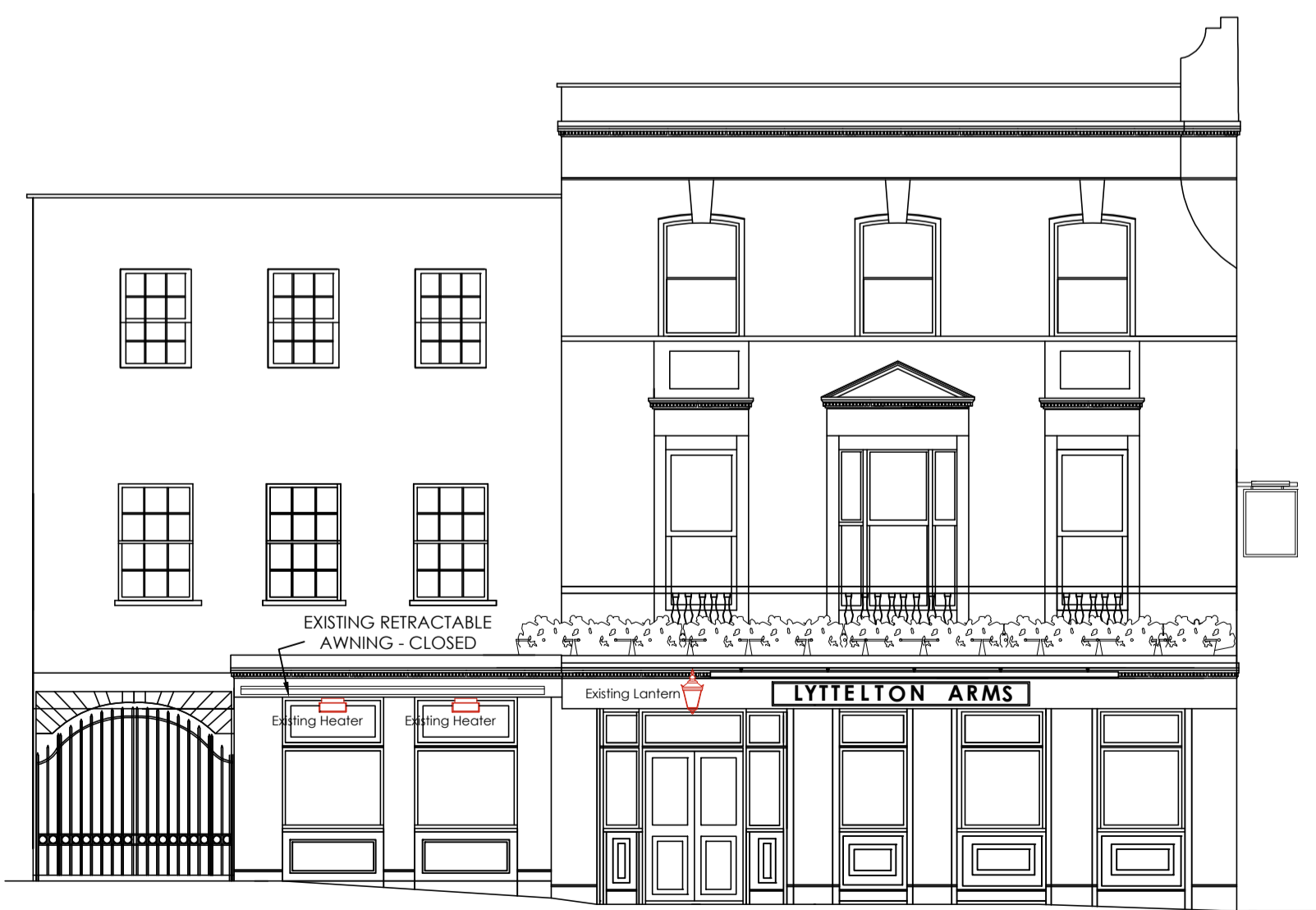
EXISTING ELEVATION TO MORNINGTON CRESCENT AWNINGS CLOSED (1:100)