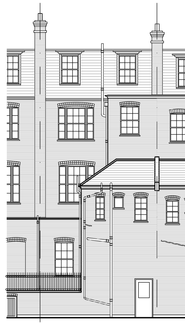
Existing and Proposed Rear Elevation 1:100