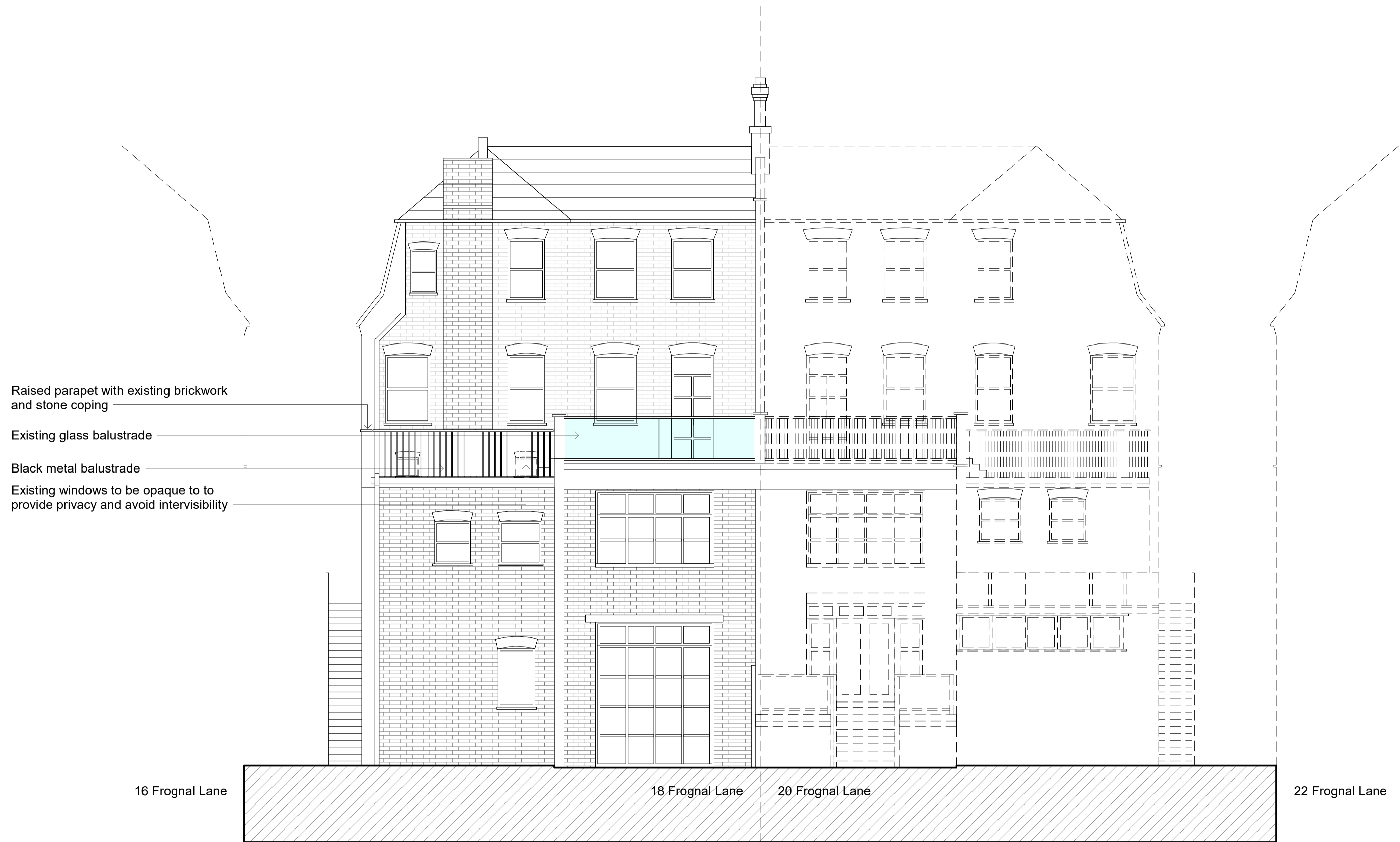
1 Proposed Rear Elevation 1:50