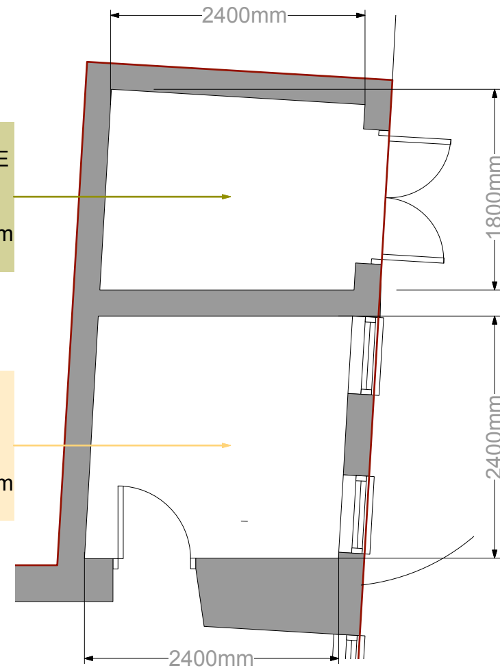
EXISTING DEDICATED INTERNAL CYCLE STORAGE ROOM 1:50@A3

EXISTING SECURE CYCLE STORAGE ROOM, OFF MAIN RECEPTION AREA. 2400mm Wide x 2400mm Deep (approx.)