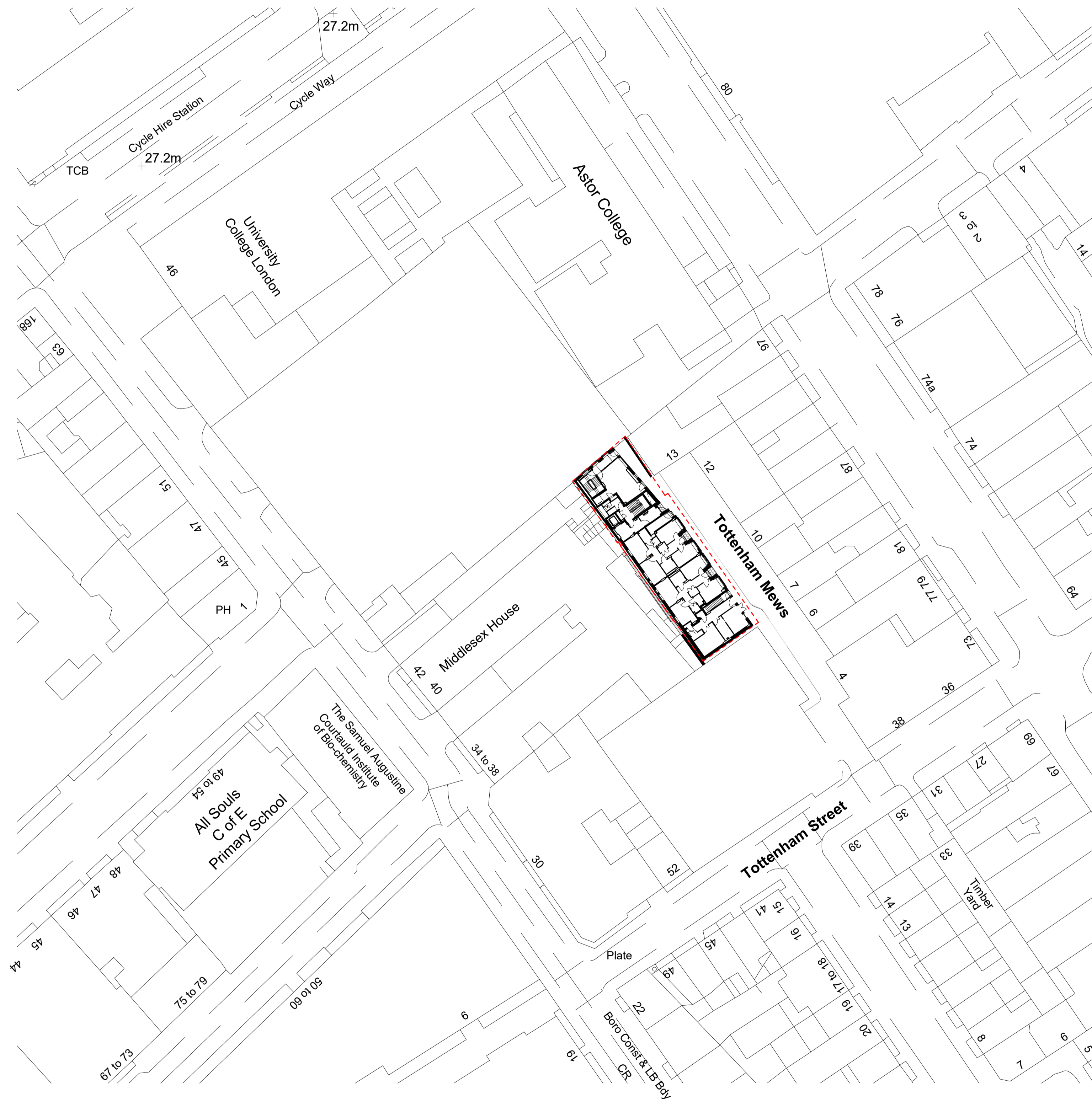
1 Site Plan - Planning - Ground Floor 1 : 500

Key: - - - Site boundary according to latest survey information from GCL: 2960-TM-Survey (2)