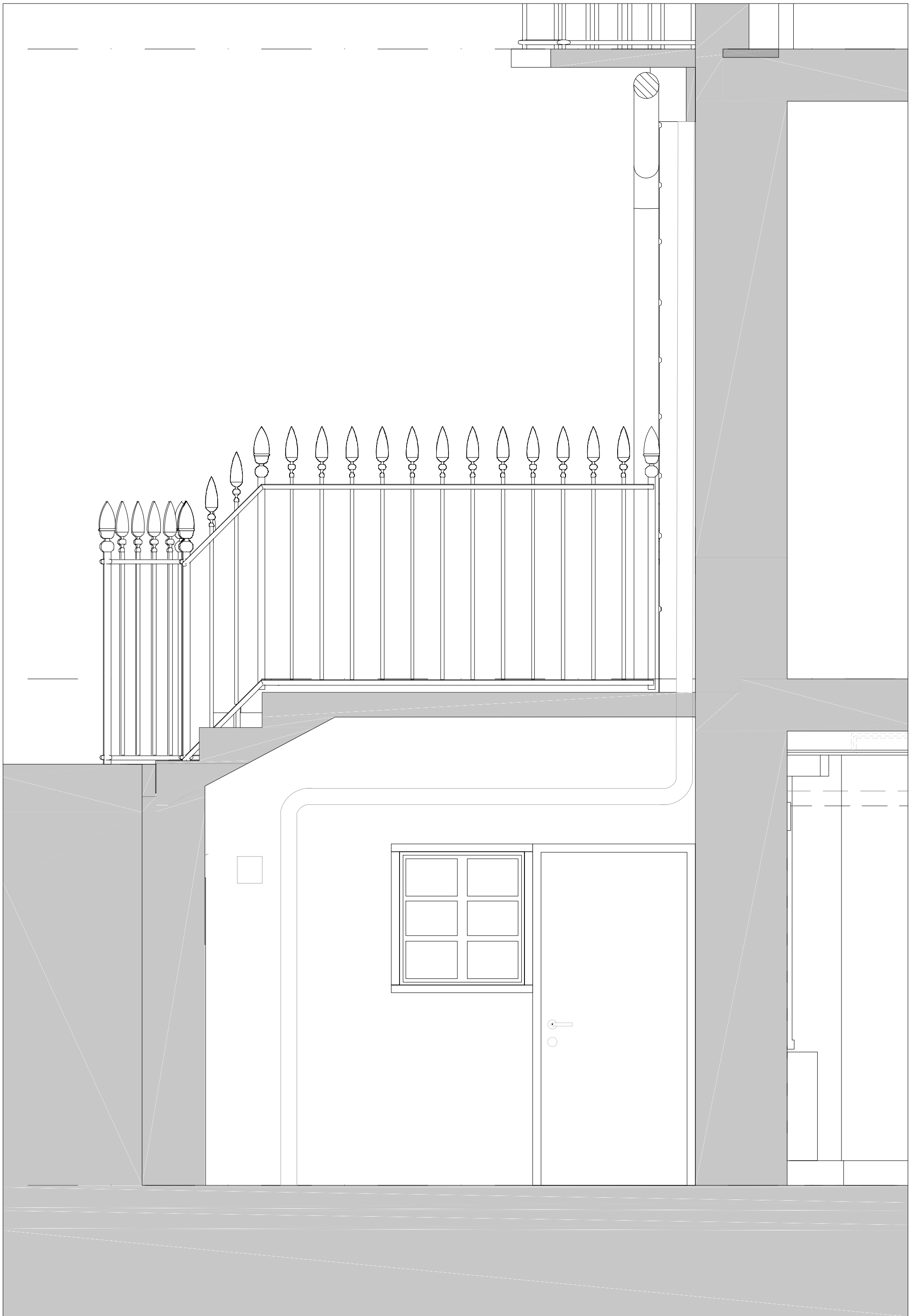
EXISTING Section Scale 1:20

THIS DRAWING IS TO BE READ IN CONJUNCTION WITH ALL RELEVANT STRUCTURAL ENGINEERS AND MECHANICAL AND ELECTRICAL ENGINEERS DRAWINGS, DETAILS AND SPECIFICATIONS.