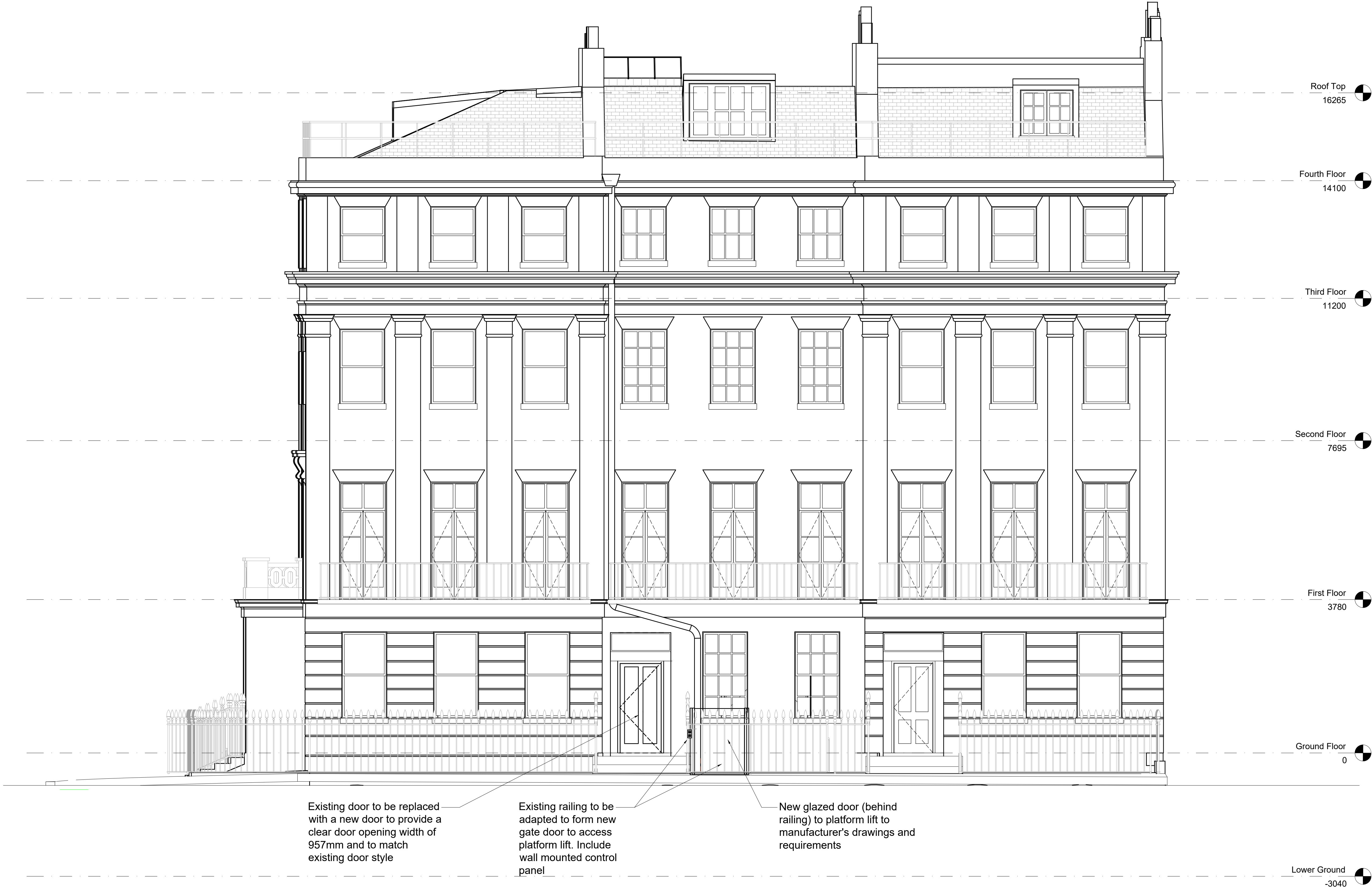
PROPOSED FRONT ELEVATION (South-West Elevation) Scale 1:50

© THIS DRAWING IS A COPYRIGHT OF BARKER ASSOCIATES. NOTES: ALL LEVELS, ANGLES AND DIMENSIONS TO BE CHECKED ON SITE PRIOR TO COMMENCEMENT OF WORKS. THIS DRAWING IS TO BE READ IN CONJUNCTION WITH ALL RELEVANT STRUCTURAL ENGINEERS AND MECHANICAL AND ELECTRICAL ENGINEERS DRAWINGS, DETAILS AND SPECIFICATIONS.